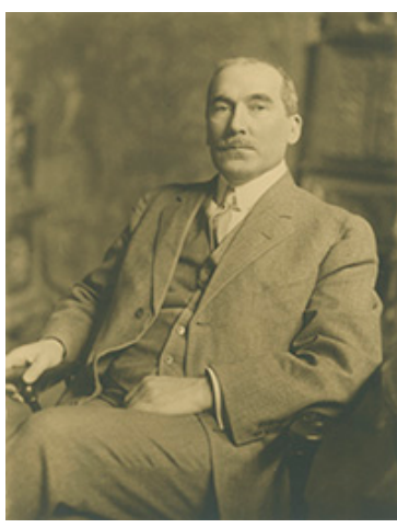
James W. Porter, Henry Golden Dearth , 1912, photograph