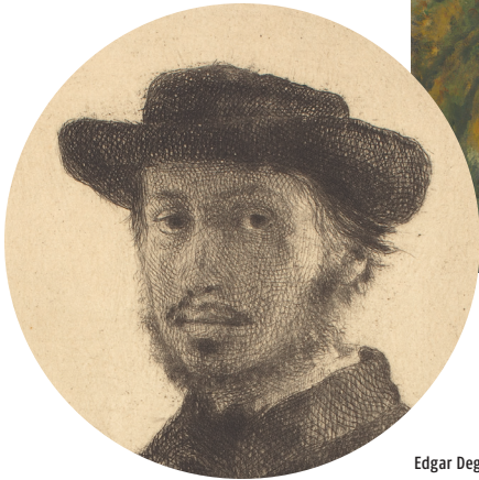
Edgar Degas, Self-Portrait ( Edgar Degas, par lui-même ) (detail), probably 1857, etching, National Gallery of Art, Rosen- wald Collection