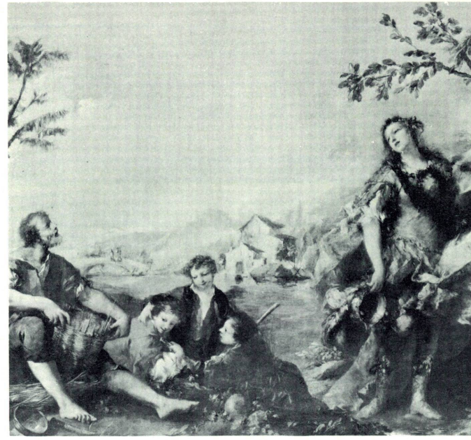
GIAN ANTONIO AND FRANCESCO GUARDI. Erminia and the Shepherds (detail)