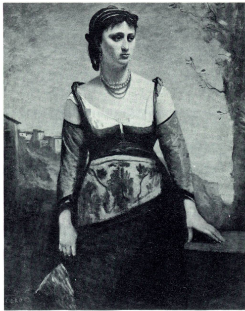
COROT. Agostina (detail)