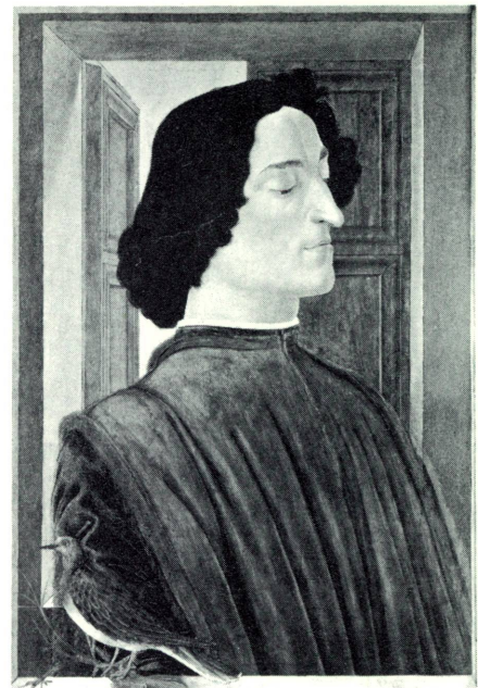
BOTTICELLI. Giuliano de' Medici

Weekdays, Luncheon Service 11 a.m. to 2 p.m.; Snack Service 2 p.m. to 4 p.m. Sundays, Dinner Service 2 p.m. to 7 p.m.