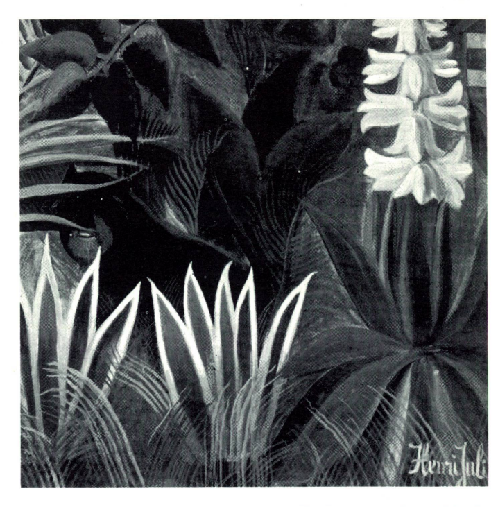
HENRI ROUSSEAU. The Equatorial Jungle (detail)