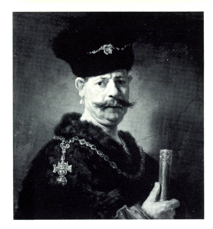
REMBRANDT, A Polish Nobleman (detail)