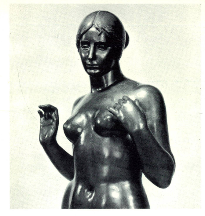
MAILLOL. Bather with Raised Arms (detail)

MONDAY, Aug. 31, through SUNDAY, Sept. 6