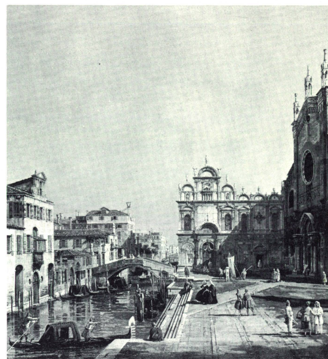
CANALETTO. View in Venice (detail)