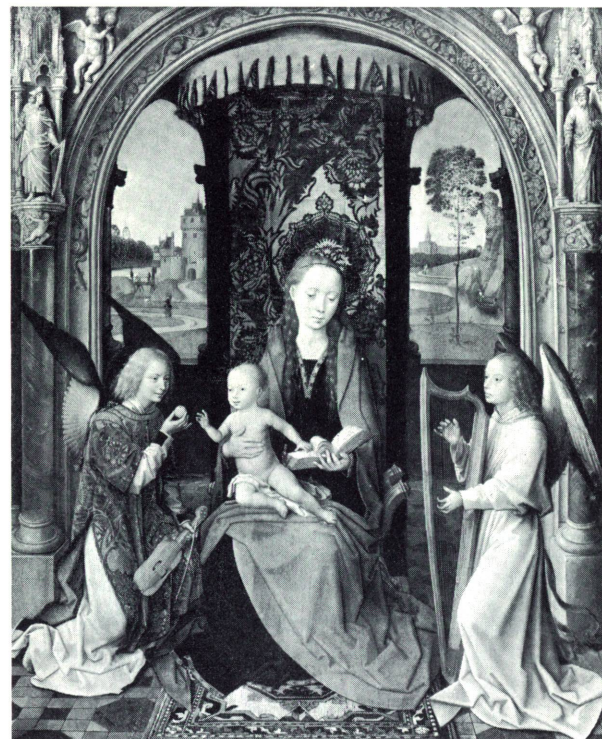
MEMLING. Madonna and Child with Angels