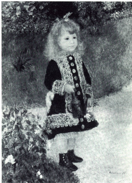
RENOIR. A Girl with a Watering Can