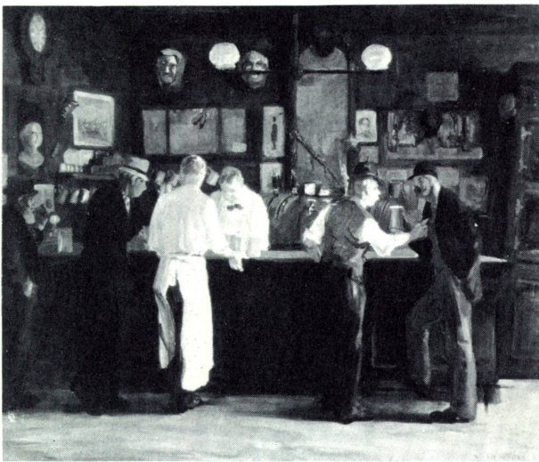
JOHN SLOAN. McSorley's Bar Lent by the Detroit Institute of Arts