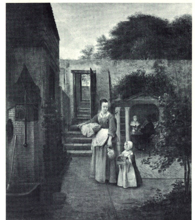
DE HOOCH. A Dutch Courtyard

MONDAY, Aug. 30, through SUNDAY, Sept. 5