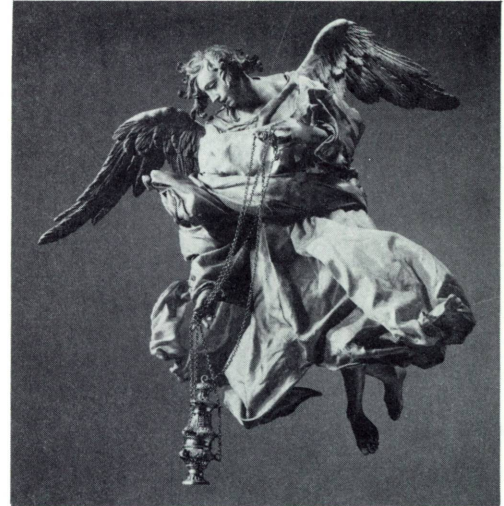
Angel with censer, attributed to Giuseppe Sammartino. Metropolitan Museum of Art, Gift of Loretta Howard, 1964

A selection of 18th-century French prints, books, and drawings from the National Gallery's Widener Collection remains on view in the Print Exhibition Room, ground floor, through January 6.