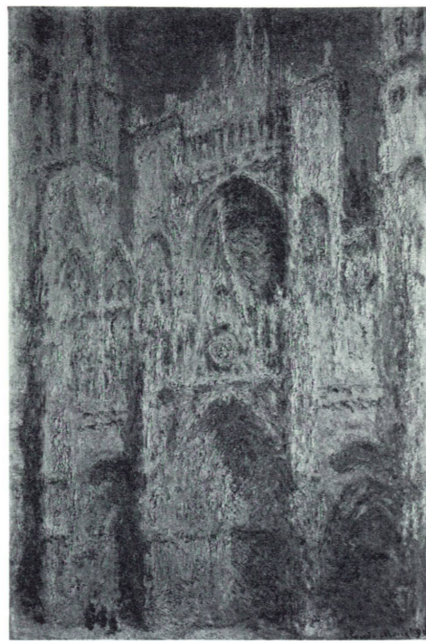
MONET. Rouen Cathedral, West Façade, Sunlight