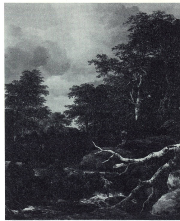
JACOB VAN RUISDAEL. Forest Scene (detail)