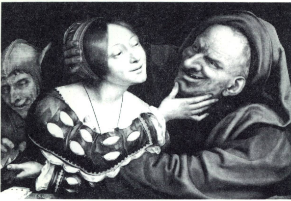
MASSYS. The Unlikely Lovers Ailsa Mellon Bruce Fund