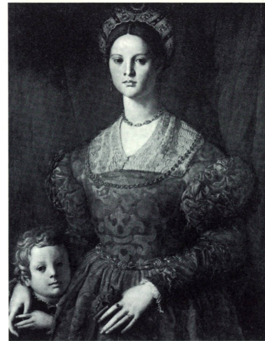
BRONZINO. A Young Woman and Her Little Boy

The gallery is open weekdays and Saturdays, 10:00 a.m. to 5:00 p.m., and Sundays, 12 noon to 9:00 p.m.