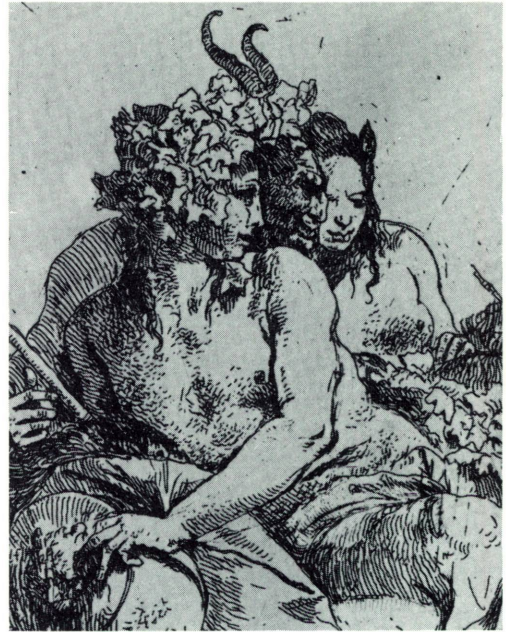
GIOVANNI BATTISTA TIEPOLO. A Bacchante with Satyr and Fauness. (detail) Rosenwald Collection