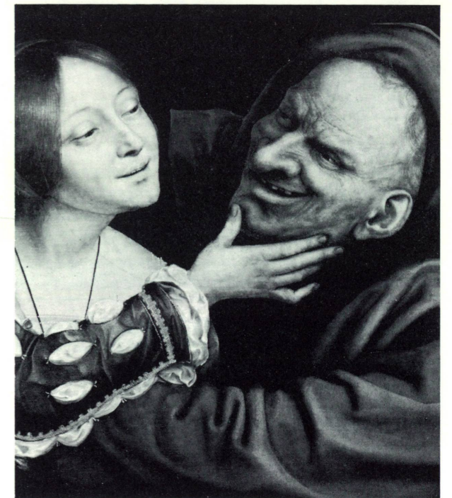
MASSYS. The Unlikely Lovers (detail)

All concerts, with intermission talks by members of the National Gallery Staff, are broadcast by Station WGMS-AM (570) and FM (103.5).