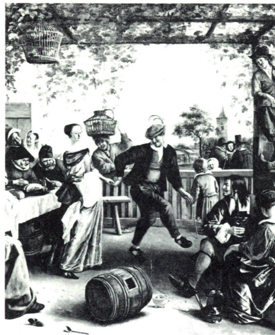
STEEN. The Dancing Couple (detail)

All concerts, with intermission talks by members of the National Gallery Staff, are broadcast by Station WGMS-FM (103.5).