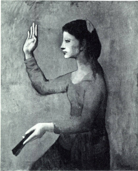
PICASSO. Lady with a Fan