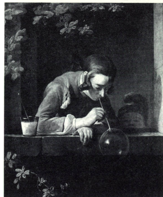
CHARDIN. Soap Bubbles

*11" x 14" reproductions with texts for sale this week—25¢ each. If mailed, 35¢ each.