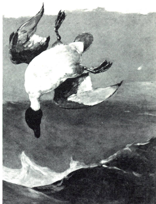
HOMER. Right and Left (detail)