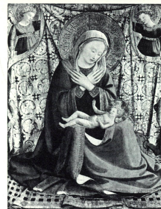
FRA ANGELICO. The Madonna of Humility

The gallery is open weekdays and Saturdays, 10:00 a.m. to 5:00 p.m., and Sundays, 12 noon to 9:00 p.m.