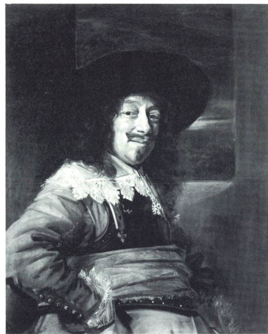
HALS. Portrait of an Officer