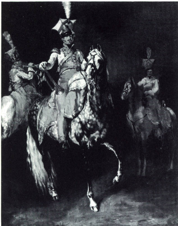
THÉODORE GÉRICAULT. Three Trumpeters Chester Dale Fund