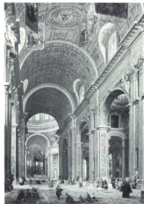
PANINI. Interior of Saint Peter's, Rome (detail)