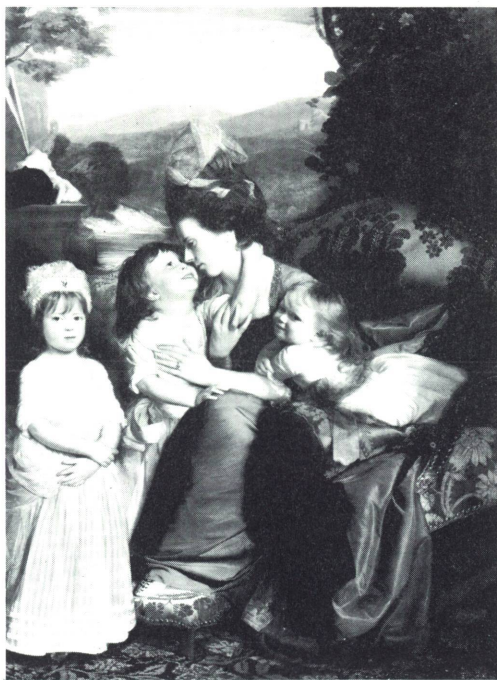
COPLEY. The Copley Family (detail)