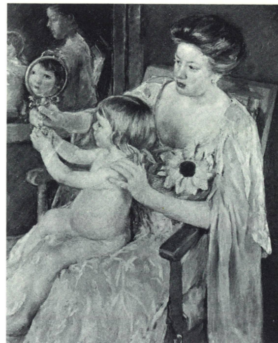
CASSATT. Mother and Child