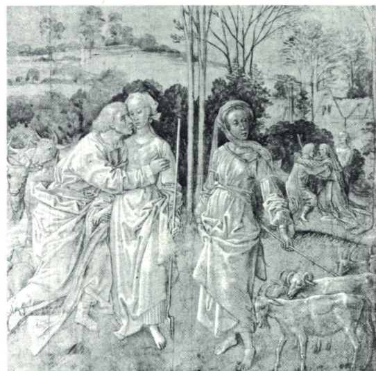
HUGO VAN DER GOES. Jacob and Rachel (detail) Christ Church, Oxford

The Gallery's exhibition, on view through January 7, is concurrent with another at the Whitney Museum of American Art which is principally concerned with Olmsted's work in and around New York City. The National Gallery exhibition, organized by the Olmsted Sesquicentennial Committee and the American Federation of Arts, will circulate to major museums throughout the country.