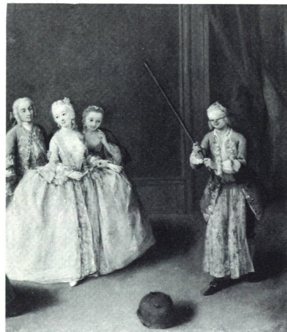
LONGHI. Blindman's Buff (detail)