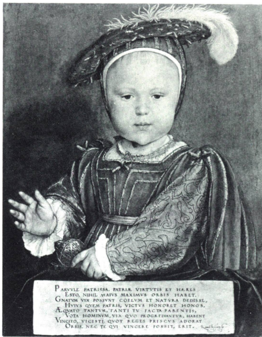
HOLBEIN THE YOUNGER. Edward VI as a Child