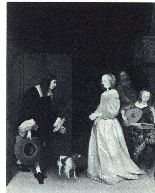
TER BORCH. The Suitor's Visit (detail)