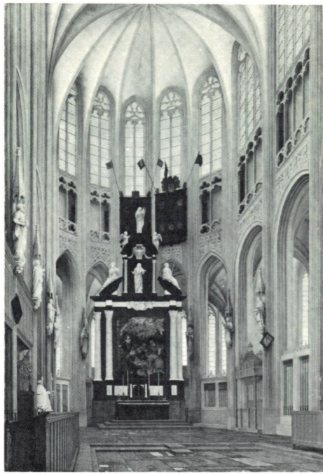
SAENREDAM. Cathedral of Saint John at s'Hertogenbosch