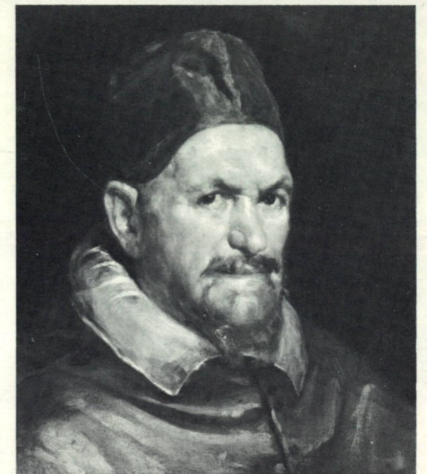
VELÁZQUEZ. Pope Innocent X