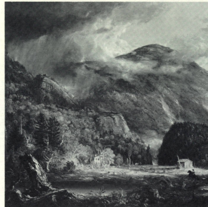
COLE. The Notch of the White Mountains (Crawford Notch) (detail)