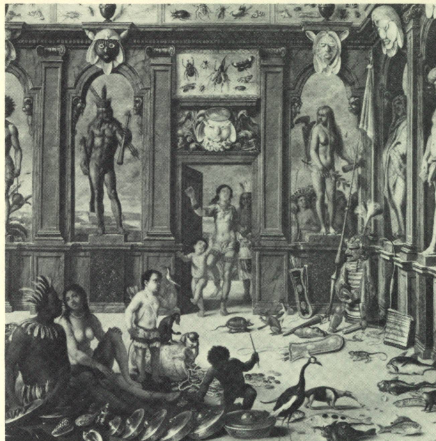
JAN VAN KESSEL THE ELDER. America (detail) (1666) Lent by the Bayerische Staatsgemäldesammlungen, Munich

The Gallery is closed Christmas Day and New Year's Day. On Christmas Eve and New Year's Eve, December 24 and 31, the cafeteria will be open from 10 a.m. until 3:00 p.m.