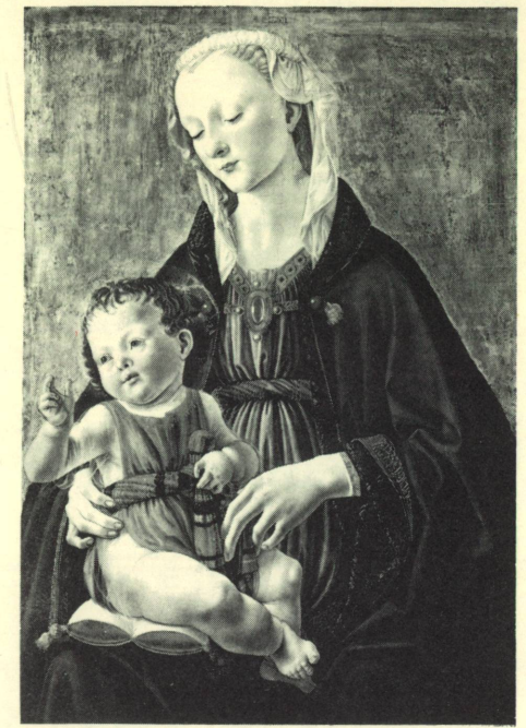
DOMENICO GHIRLANDAIO. Madonna and Child

All concerts, with intermission talks by members of the National Gallery Staff, are broadcast by Station WGMS-AM (570) and FM (103.5).