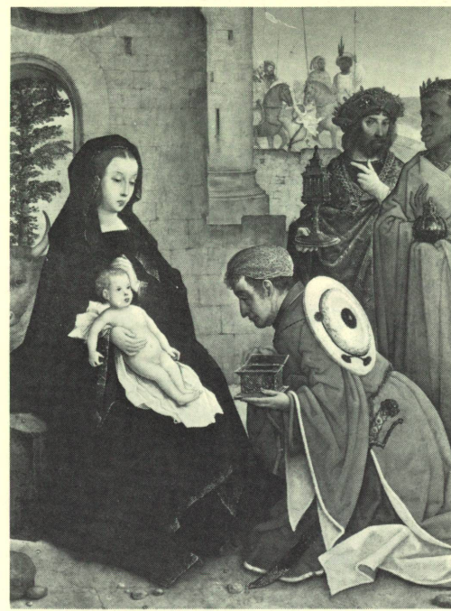
JUAN DE FLANDES. The Adoration of the Magi

†Color postcards with texts for sale this week—10c each, postpaid.