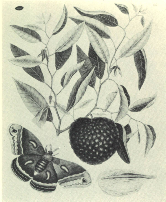
MARK CATESBY. Carolina Moth and Custard Apple (1731-1749) Lent by Middleton Place, Charleston, South Carolina