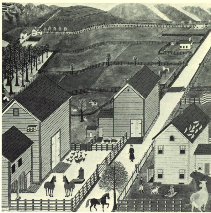
AMERICAN SCHOOL, Mahantango Valley Farm (detail)