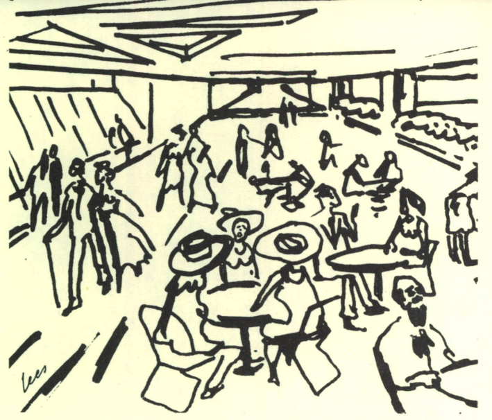
Herman and Lees Associates, Cambridge

From July 12 through August 29, the National Gallery's special Sunday Lectures will survey the painting, sculpture and architecture of the United States. They will be, in effect, a brief course on the history of American art. In July, architecture and painting from the colonial period to the mid-nineteenth century will be discussed. The August lectures will be devoted to art from the Civil War period to modern times. Illustrated with slides, the lectures are being given by members of the Gallery's education staff at 4:00 p.m. in the Gallery Auditorium.