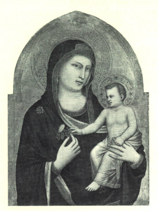
GIOTTO. Madonna and Child

The Building of the Capitol Auditorium 2:00 & 4:00