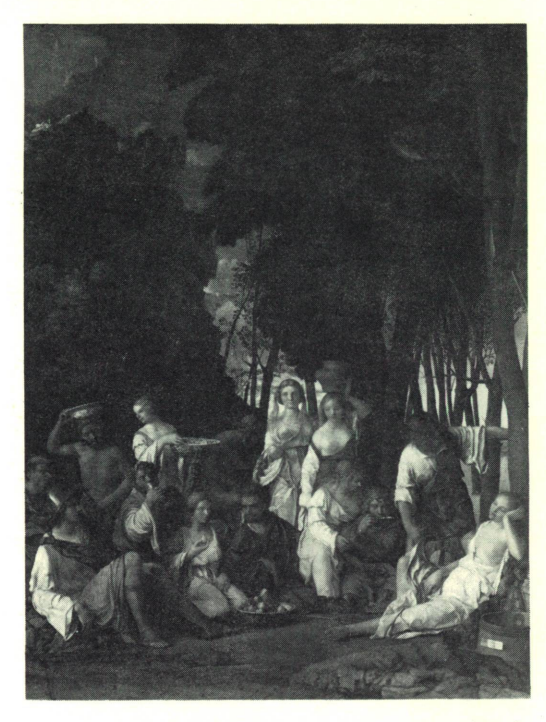
BELLINI. The Feast of the Gods (detail)