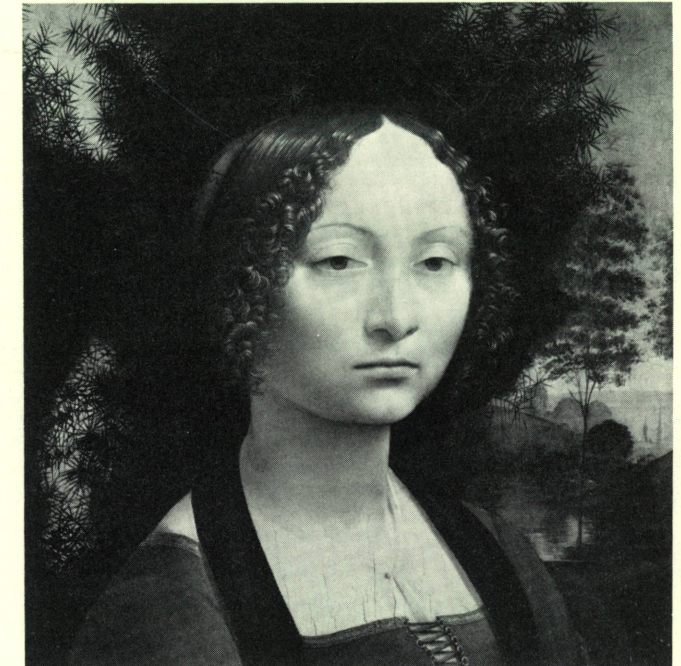
LEONARDO. Ginevra de' Benci

MONDAY, November 22 through SUNDAY, November 28