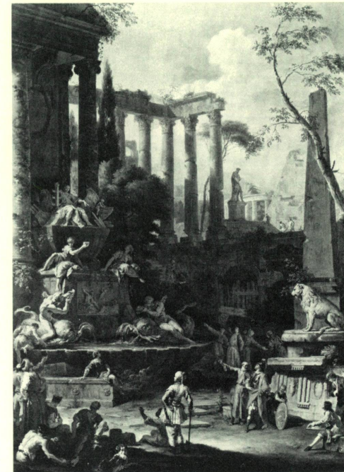
Memorial to Admiral Sir Cloudisley Shovell

MONDAY, November 15 through SUNDAY, November 21