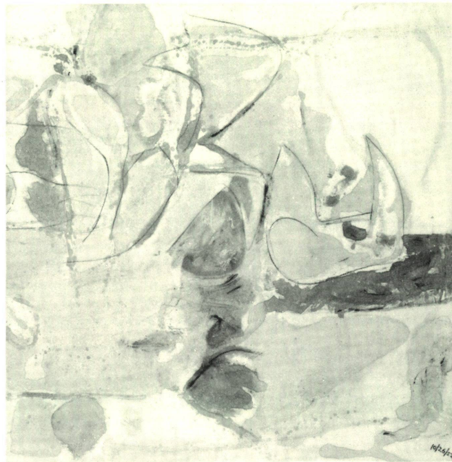
FRANKENTHALER. Mountains and Sea (detail)

MONDAY, November 1 through SUNDAY, November 7