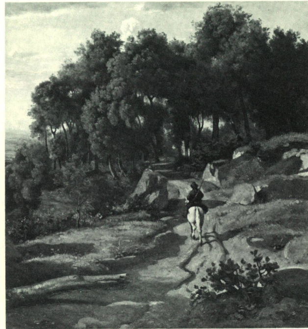
COROT. A View near Volterra (detail)

MONDAY, November 8 through SUNDAY, November 14