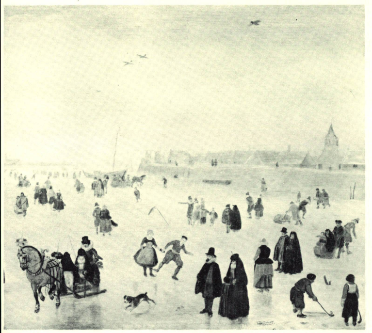
AVERCAMP. A Scene on the Ice (detail)