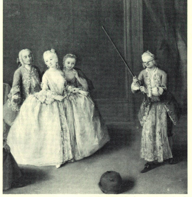
LONGHI. Blindman's Buff (detail)