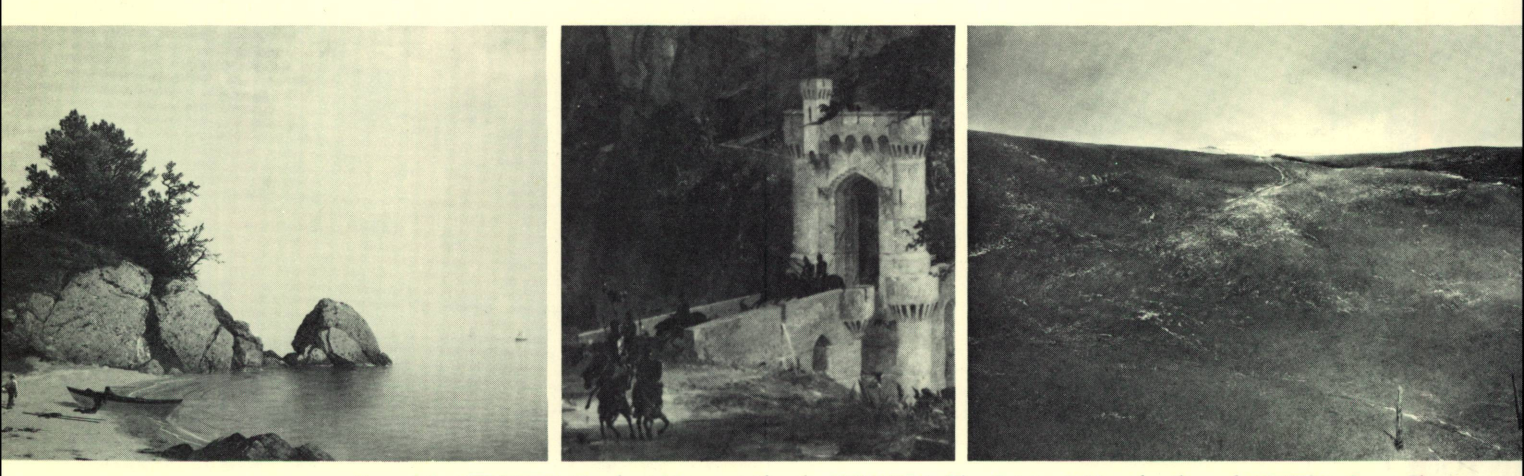
From left: KENSETT. Beach at Newport (detail), CROPSEY. The Spirit of War (detail), and WYETH. Snow Flurries