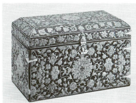
Embroidered sharkskin box, second half 16th century Topkapı Palace Museum, Istanbul

The First Three Georges (from the series Royal Heritage with Huw Wheldon, 60 min.) Wed. through Sat. 12:30 Sun. 1:00