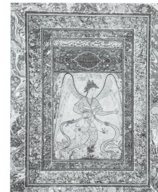
Peri with a lute from an album, mid-16th century Topkapı Palace Museum, Istanbul

Pass System. On crowded weekdays and weekends free passes will be distributed if necessary on a first-come, first-served basis. Passes are for specified half-hour entry times and may be obtained at the special exhibition desk on the Ground Floor of the East Building. There are no advance reservations.