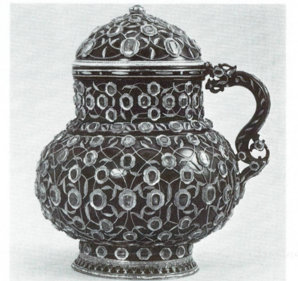
Jeweled black stone jug with lid, second half 16th century Topkapı Palace Museum, Istanbul

The exhibition presents the highest aesthetic and technical achievement of the Ottoman Empire during the reign of Sultan Süleyman I (1520-1566). Known in Turkey as Kanuni , or "Lawgiver," in reference to his exemplary judicial acts which contributed to many Western constitutional laws, the sultan was a renowned legislator, statesman, poet, and generous patron of the arts. Highlighted are such Turkish national treasures as an inlaid wooden throne, a unique map of the Americas made in 1513, the illustrated