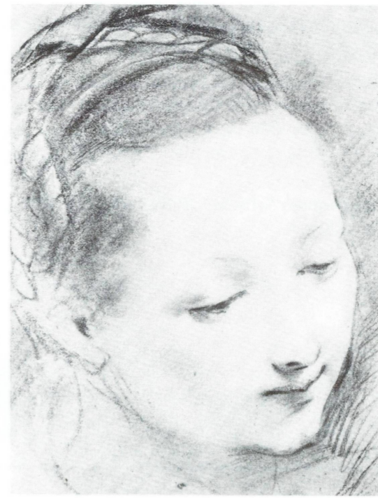
Federico Barocci, Head of the Virgin Windsor Castle, Royal Library

This is the first survey exhibition of the greatest Italian drawings in the British Royal Collection ever to travel from England. Ranging from the Renaissance through the baroque periods, more than 60 drawings will be on view, including seven works by Leonardo, four by Michelangelo, and three by Raphael. Other extraordinary early drawings by Giovanni Bellini and Domenico Ghirlandaio will be included, along with mannerist drawings by Parmigianino and Tintoretto. Baroque works by Bernini and Guercino will also be on view. The survey, which is intended to show the finest and most beautiful Italian drawings in the British Royal Collection, concludes with four drawings by Piazzetta and five by Canaletto. Pan American World Airways has been designated the official carrier of this exhibition, which is supported by an indemnity from the Federal Council on the Arts and the Humanities.