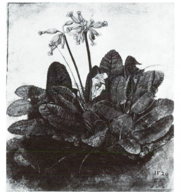
Albrecht Dürer, Tuft of Cowslips , 1526 The Armand Hammer Collection

One of the finest collections of drawings in American private hands are on view in the graphics galleries in the West Building. The selection includes sheets by Albrecht Dürer, Leonardo da Vinci, Raphael, Correggio, Rembrandt, Watteau, and Fragonard, as well as a rare sketchbook by Gauguin. The collection has been formed by Dr. Armand Hammer of Los Angeles.