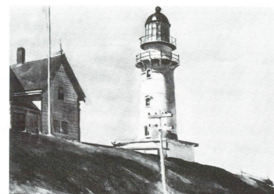
Edward Hopper, Lights at Two Lights , c. 1927 Collection of the Whitney Museum of American Art, Bequest of Josephine N. Hopper

Recorded Information. Current information on the American Drawings and Watercolors of the Twentieth Century is available by calling (202) 842-3472.