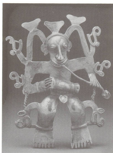
Diquís, Shaman with Drum and Snake , Museos del Banco Central de Costa Rica, San José

Weekday visits recommended. For recorded pass information, call the National Gallery at (202) 842-6684. For additional questions and availability of same-day passes, call (202) 842-6690.