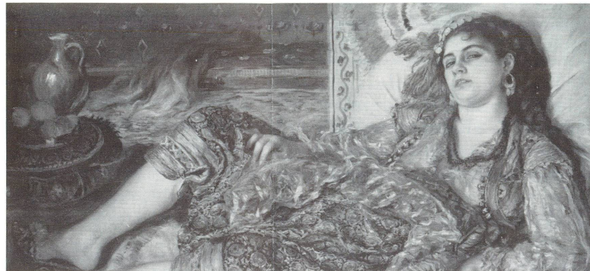
Auguste Renoir, Odalisque (detail), dated 1870, National Gallery of Art, Chester Dale Collection

November 5: French ; November 12: Spanish ; November 19: German ; November 26: Italian .