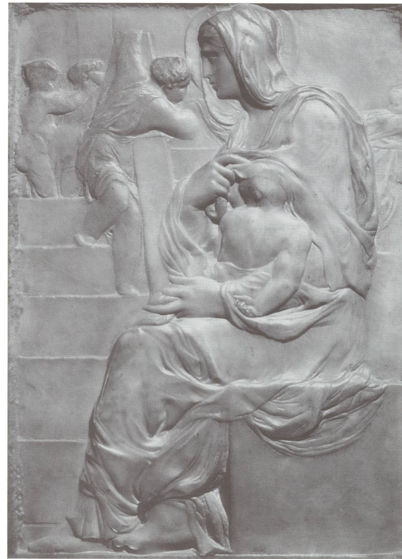
Michelangelo, Madonna of the Stairs , Ente Casa Buonarroti, Florence

"The Americas," the final section, surveys the art of the great empires