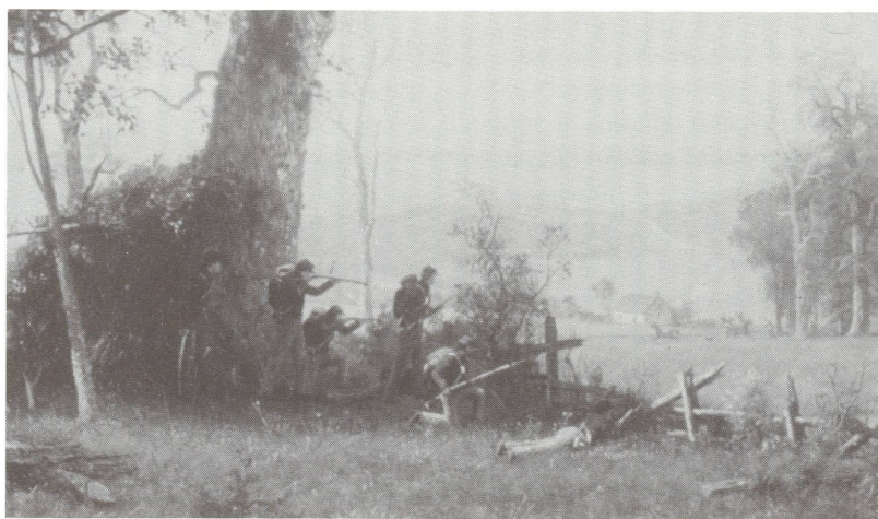
Albert Bierstadt, Guerrilla Warfare (Picket Duty in Virginia) (detail), 1862, The Century Association, New York

Great Landscapes , a program for children between ages six and ten accompanied by an adult will take place on Saturdays, November 9, 16, and 23, from 1:00 to 3:00. The program includes a tour of the exhibition, an art project, and take-home materials. Great Landscapes is free, but pre-registration is required; for more information call (202) 842-6796.