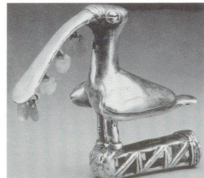
Sinú, Animal Effigy Finial , Museo del Oro, Banco de la República, Bogotá

The Renaissance: Fifteenth-Century Northern Art