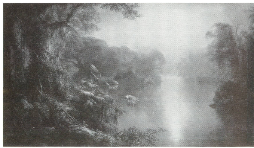
Frederic Edwin Church, Morning in the Tropics (detail), dated 1877, National Gallery of Art, Gift of the Avalon Foundation

Science and Sentiment in Frederic Church's "Morning in the Tropics"