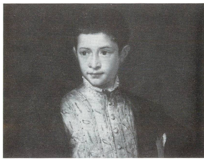
Titian, Ranuccio Farnese (detail), 1542, National Gallery of Art, Samuel H. Kress Collection

10:30 Film: Masters of Illusion 11:00 Lecture: Circa 1492 12:00 Gallery Talk: Gérôme and Renoir: The Mystique of Orientalism 12:30 Film: Tradesmen and Treasures 1:30 Film: Masters of Illusion