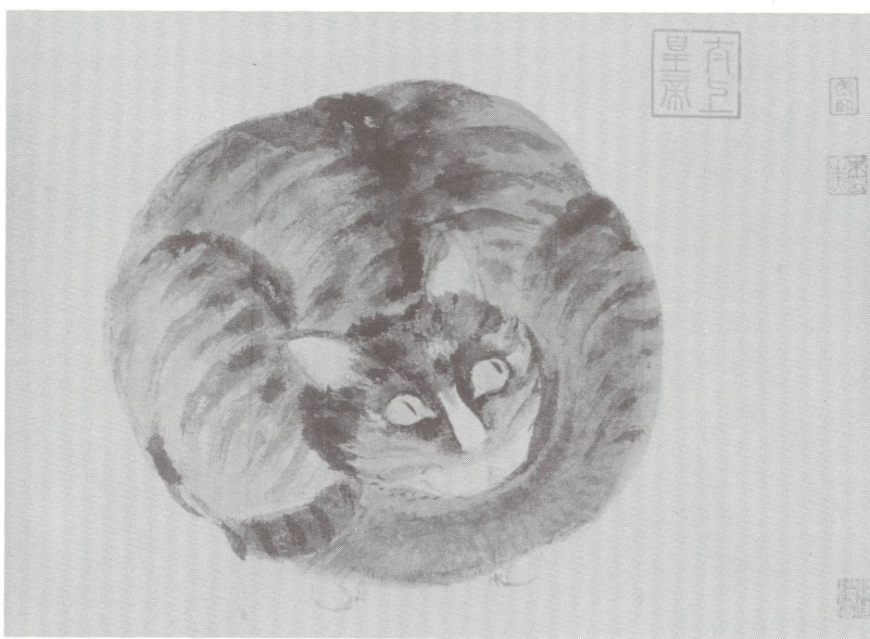
Shen Zhou, Cat from Drawings from Life: Plants, Animals and Insects (detail), dated to 1494, National Palace Museum, Taipei