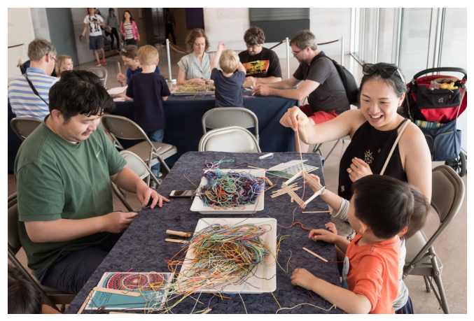
A family creates art together during a recent community weekend program.

Discover a variety of multigenerational programs and resources that engage children, teens, and adults in active exploration of art.