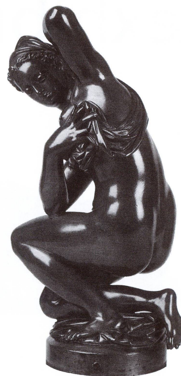
Antonio Susini, Crouching Venus , after a model by Giovanni Bologna, early seventeenth century, bronze, Robert H. Smith Collection.