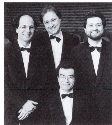
Orpheus String Quartet performing October 27