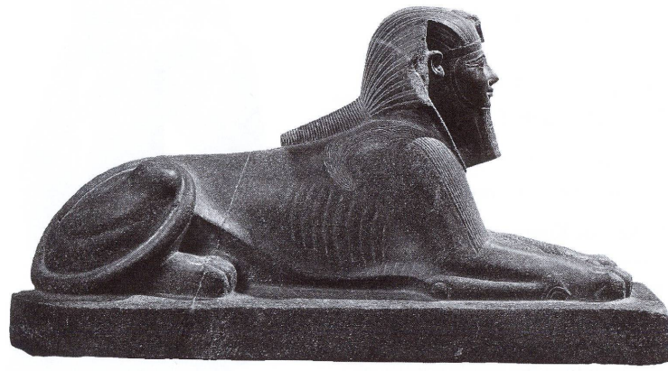
Sphinx of Thutmose III, Eighteenth Dynasty, reign of Thutmose III, 1479-1425 BC, The Egyptian Museum, Cairo.