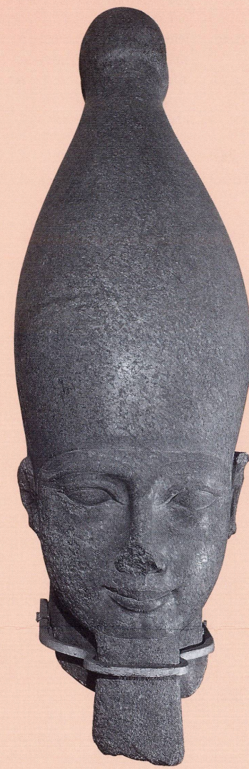
Colossal head of Ramesses II usurped from Senusert I, Nineteenth Dynasty, reign of Ramesses II, 1279–1213 BC, Egyptian Museum, Cairo.