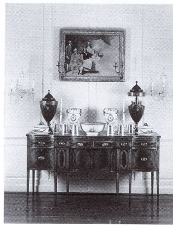
Dupont Dining Room, Benjamin West's American Commissioners of the Preliminary Peace Negotiations with Great Britain (1783-1784); New York sideboard (1795-1805); six matching silver Paul Revere tankards (1772); and pair of mahogany urn-shaped knife boxes (1790-1800). Winterthur Museum, Gift of Henry Francis du Pont (West and Revere); Bequest of Henry Francis du Pont (sideboard and boxes).

The exhibition is organized by Winterthur and the National Gallery of Art, Washington.