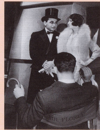
Film still from The Hole in the Wall, Unseen Avant-Garde series, photograph courtesy Bruce Posner.

12:00 Gallery Talk An Introduction to Self-Portraits (wb)