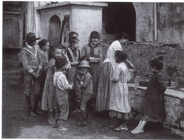
Alfred Stieglitz, The Last Joke—Bellagio, 1887, National Gallery of Art, Washington, Alfred Stieglitz Collection.

The exhibition is supported by an indemnity from the Federal Council on the Arts and the Humanities.