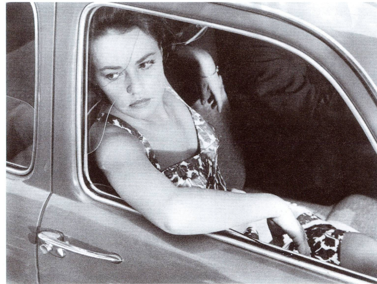
Film still from La Notte screening on August 16 as part of the Michelangelo Antonioni: The Italian Treasures series.

The largest and most influential film studio in Russia, Mosfilm first opened its doors in Moscow in the early 1920s. From historical epics to musicals, propaganda films, and enduring classics, Mosfilm's contributions to film history are beyond compare. The series includes six feature films from the 1960s through the present day.