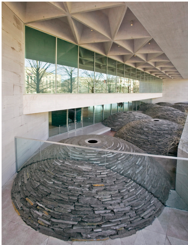
Andy Goldsworthy, Roof , 2004 – 2005, National Gallery of Art, Washington, Patrons' Permanent Fund

Join docents for this hour-long exploration of the iconic sculptures on view in the atrium during renovation of the East Building galleries, including works by Alexander Calder, Anthony Caro, Andy Goldsworthy, Ursula von Rydingsvard, and others.