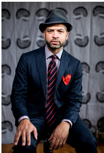
Jason Moran.

March 28, 8:00, Kennedy Center Eisenhower Theater Celebrating Monk's Town Hall Performance Celebrate the legacy of Thelonious Monk as Jason Moran leads his eight-piece ensemble, The Big Bandwagon, in a multimedia work based on Monk's landmark 1959 concert at New York City's Town Hall. (80 minutes, no intermission)