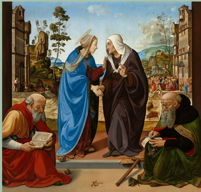
Piero di Cosimo, The Visitation with Saint Nicholas and Saint Anthony Abbot , c. 1489/1490, National Gallery of Art, Washington, Samuel H. Kress Collection