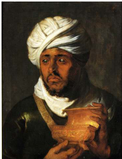
Peter Paul Rubens, One of the Three Magi (Balthasar) , c. 1618, Museum Plantin-Moretus, Antwerp – UNESCO World Heritage

Organized by National Gallery of Art, Washington