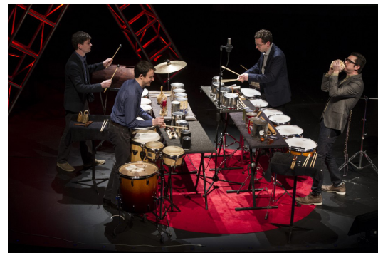
Third Coast Percussion performing on March 22.