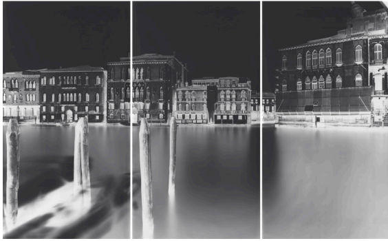
Vera Lutter, Ca' Del Duca Sforza, Venice II , January 13–14, 2008, 2008, National Gallery of Art, Washington, Alfred H. Moses and Fern M. Schad Fund

Organized by the National Gallery of Art, Washington