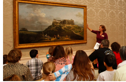
A gallery educator leads a tour in front of Bernardo Bellotto's The Fortress of Königstein, 1756–1758 , National Gallery of Art, Washington, Patrons' Permanent Fund.

Download self-guided tours or participate in a variety of docent-led tours. Tours and gallery talks begin in the West Building Rotunda or at East Building Information Desk.