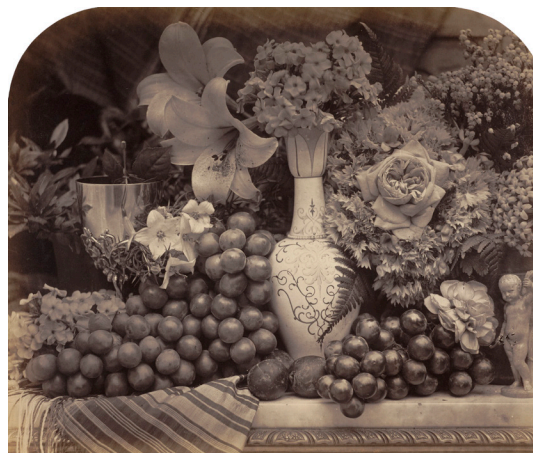
Roger Fenton, Fruit and Flowers , 1860, National Gallery of Art, Washington, Paul Mellon Fund

Organized by National Gallery of Art, Washington