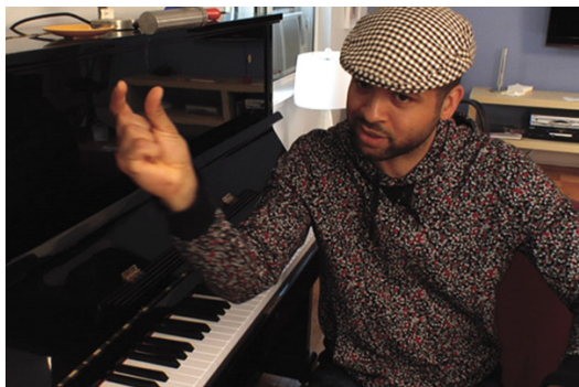
Jazz pianist Jason Moran, from In My Mind

In collaboration with the John F. Kennedy Center for the Performing Arts