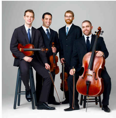
JACK String Quartet performing on March 8 and 11.