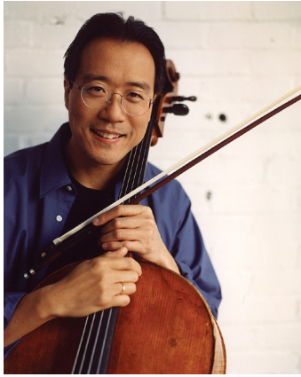
Yo-Yo Ma.

Coordinated with the Foundation for Art and Preservation in Embassies (FAPE).