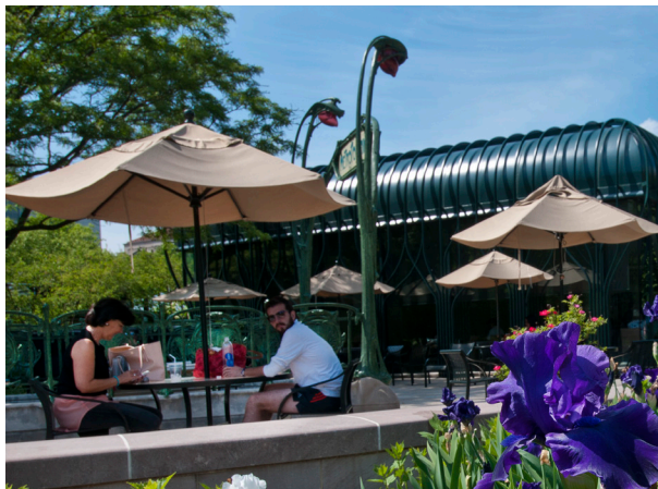
Diners enjoy a casual lunch menu and Sculpture Garden blossoms.