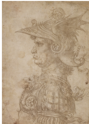
Leonardo da Vinci, A Bust of a Warrior , c. 1475/1480, On loan from The British Museum, London, © the Trustees of the British Museum

Organized by the National Gallery of Art, Washington in association with The British Museum, London / Made possible by a generous gift in memory of Melvin R. Seiden / The Exhibition Circle of the National Gallery of Art is also supporting the exhibition / Supported by an indemnity from the Federal Council on the Arts and the Humanities