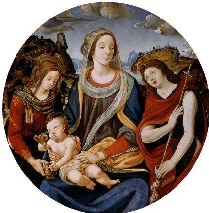
Piero di Cosimo, Madonna and Child with Saints Mary Magdalene and John the Baptist , c. 1495, Musée des Beaux-Arts, Strasbourg