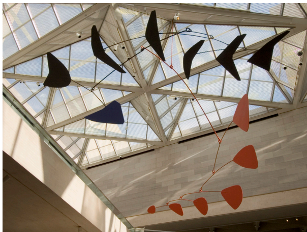
Alexander Calder, Untitled , 1976, National Gallery of Art, Washington, Gift of the Collectors Committee