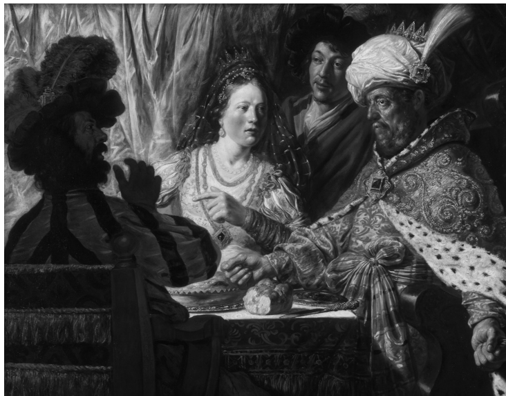
Jan Lievens, The Feast of Esther , c. 1625. North Carolina Museum of Art, Raleigh. Purchased with Funds from the State of North Carolina