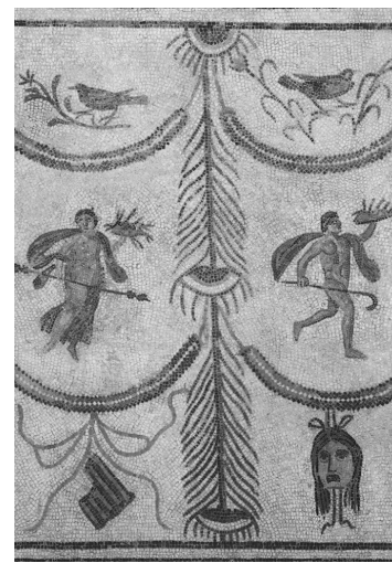
Symbols of Bacchus as God of Wine and the Theater (detail) , AD c. 200/225. Given to the National Gallery of Art for the American People from the People of Tunisia

The Italian Cabinet Galleries are designed to evoke the interior of an Italian Renaissance palace or villa. The suite of three rooms showcases paintings and precious objects like those kept in the home of a prince, humanist, or well-to-do merchant. Many of these works reveal the Renaissance fascination with classical Greece and Rome.