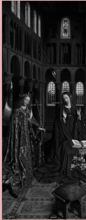
Jan van Eyck, The Annunciation , c. 1434/1436. National Gallery of Art, Washington, Andrew W. Mellon Collection