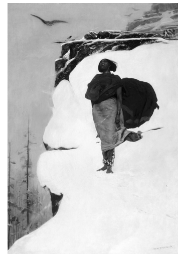
George de Forest Brush, Mourning Her Brave, 1883. Gilcrease Museum, Tulsa, Oklahoma