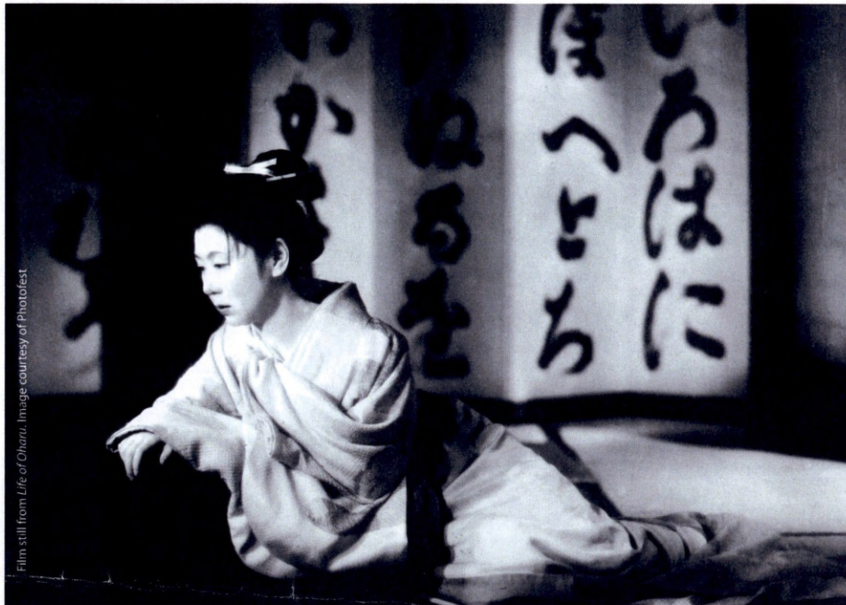
Film still from Life of Oharu .

In Honor of the Exhibition Colorful Realm: Japanese Bird-and-Flower Paintings by Itō Jakuchū (1716–1800) on view from March 30 through April 29, 2012