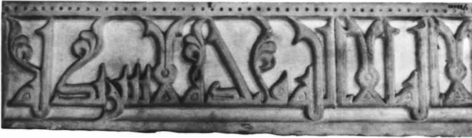
Kufic Inscription with Interlocked Lam-Alif. Egypt, tenth century. Cairo, Islamic Art Museum

derstand the workings of love in their lives. Indeed, the ligature lām-alif in particular seems to have served as a lightning rod to which those seeking alternate modes of piety were attracted.