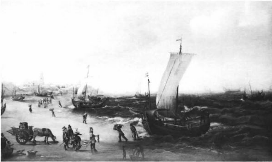
Hendrick Vroom, The Beach at Scheveningen . Whereabouts unknown.