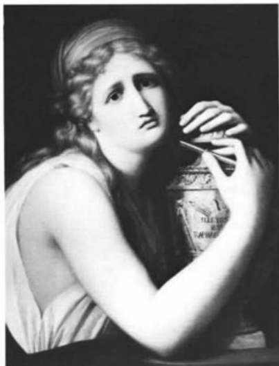
Gaspare Landi, Painting Mourning the Death of Raphael . 1795. Milan, Pinacoteca Ambrosiana.

among the artists who sat for him. His principal rival in this field seems to have been Angelika Kauffmann.