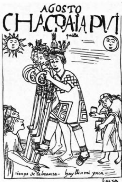
August. The Inca King Initiating the Season of Planting, Wearing the Casana Tunic.

Ailsa Mellon Bruce Senior Fellow, spring 1986