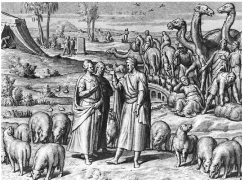
Pedro Campaña, Jacob Asking for Rachel's Hand in Marriage . Leiden, Prentenkabinet.

Cette série devait comporter plus de 50 dessins destinés à la gravure, mais dont la réalisation a dû être interrompue par le mort de l'artiste. Les