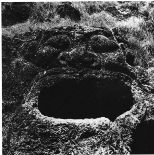
Mascaron (grotesque mask), Easter Island.

Assuming that contact between European sailors and the indigenous inhabitants took place toward the middle of the sixteenth century, soon after the first traversals of the Strait of Magellan, one can explain these enigmas of Easter Island. Compared with European contemporary sculpture, the Pasquan “ mascaron ” is volumetrically well preserved in all component elements: eyes, cheekbones, nose, mouth, lips, and beard are present and identifiable. The parallel I have drawn between the Pasquan mascarons and similar drawings by Aloiso Giovannoli or Antonio Salamanca is very striking. The decorative character of the drawings of Renaissance masks is similar to the designs found in the representations of the chief Pasquan god Make-Make, who is also represented in the form of the domino mask identical to that of the commedia dell’arte . Moreover, the god’s name has