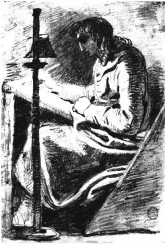
Felice Giani (1758–1823), Self-portrait Drawing by Lamplight , Cooper-Hewitt Museum, New York.

uity. These works provide evidence for common working habits, similar cultural interests, and close stylistic affinities in the Rome of that period. Giani's Italian circle was made up of the few native Romans or permanent resident painters there with whom Giani had close cultural contact. Again, these relationships became evident in researching and sorting through numerous drawings by Giuseppe Cades, Giovanni Battista dell'Era, Angelica Kauffmann, Domenico Corvi, and others.