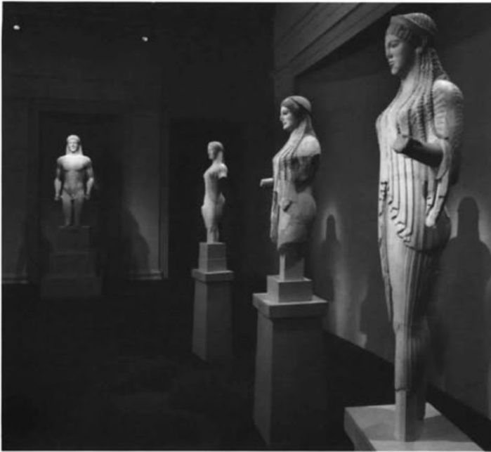
The Human Figure in Early Greek Art , 31 January–12 June 1988, exhibition installation, National Gallery of Art, Washington.

My project also brought me to examine the long-standing problem of how Polykleitos applied his theories to his work. Guided by a concern to set the Canon in context, I have focused less on the seemingly innovative methods of this treatise than on aspects of it that can be shown to draw on already existing practice. I concentrated particularly on proportional theory, tracing an approach to sculptural proportion that is first known from major works at the beginning of the classical style, foremost among them being the Kritian Boy , and which recurs essentially unchanged in Roman copies of the Doryphoros and Diadoumenos . The method is attested in written form by Vitruvius.