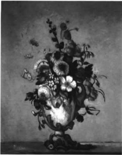
Paul Cézanne, Flowers in a Rococo Vase , c. 1876, National Gallery of Art, Washington, Chester Dale Collection.