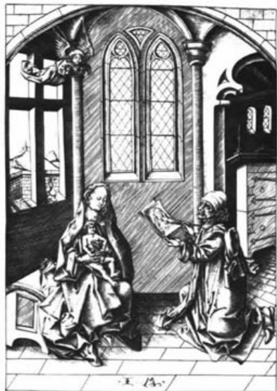
Israhel van Meckenem, Saint Luke Painting Portrait of the Virgin , c. 1450–1503, National Gallery of Art, Washington, Rosenwald Collection.

Institute of Fine Arts, New York University Samuel H. Kress Senior Fellow, 1987–1988