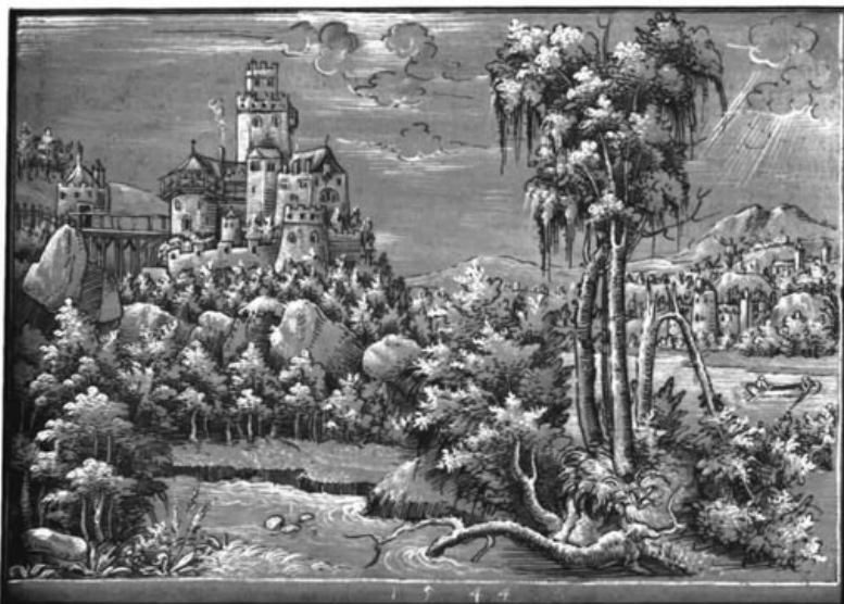
German, Landscape with a Castle , 1544, National Gallery of Art, Washington, Rosenwald Collection.

The preparatory work of the catalogue began some months ago. My fellowship was intended to allow further intensive research and, above all, to complete details of bibliography, especially entries on American exhibition catalogues, which can be checked in the National Gallery of Art library better than anywhere in Europe. It also proved to be profitable to use the photographic archives. Help came unexpectedly from an exhibition of Greek sculpture, The Human Figure in Early Greek Art , shown at that time in the Gallery, which contributed to the study of the revival of the antique pose of the mourner in Renaissance art.