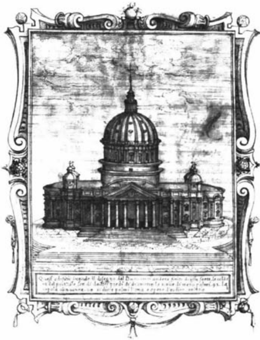
Etienne Duperac, attributed to, Disegni di la ruine di Roma , 1574/1575 Pierpont Morgan Library, New York, on loan from the Feltrinelli Collection.