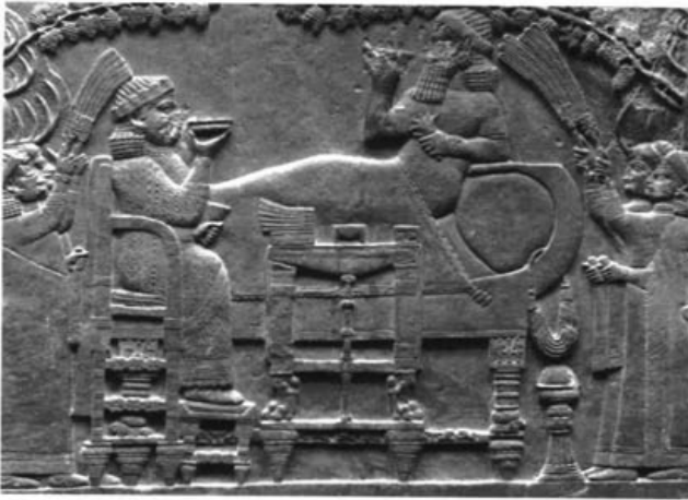
Ashurbanipal and Queen in Garden , (c. 669–630 B.C.), British Museum, London.

(reminding us of the disfigurement by which adultresses were punished). This gives a background to the strange fate of the splendid copper head of a Mesopotamian ruler found in the same destruction context: one eye destroyed, the nose violently attacked, and both ears chiseled off. This surprising fact finds its explanation in a well-known inscription of the Persian king Darius who reports what happened to two Median pretenders: “Then I cut off his nose, his two ears and blinded one eye of his. . . .” This passage evidently describes a special type of corporeal punishment current in the Median-Persian sphere and ceremonially carried out in effigy on the royal copper head by Nineveh’s Median conquerors.