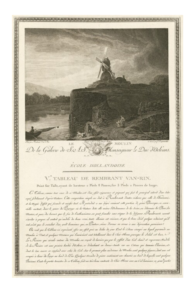
fig. 2 Etching in reverse of The Mill , from the 1786 catalog of the Duc d'Orléans Collection