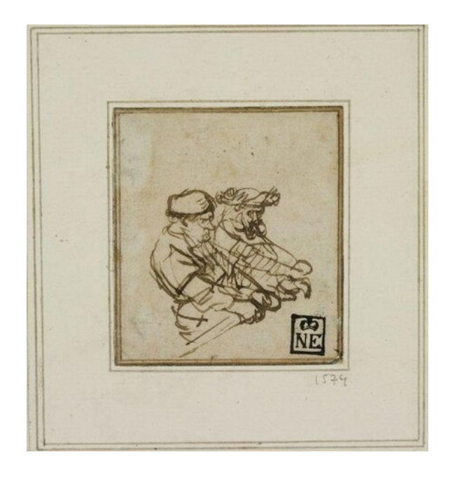
fig. 6 Rembrandt van Rijn, Two Men Rowing , c. 1645, pen and ink, Szépmüvészeti Múzeum, Budapest, inv. 1871