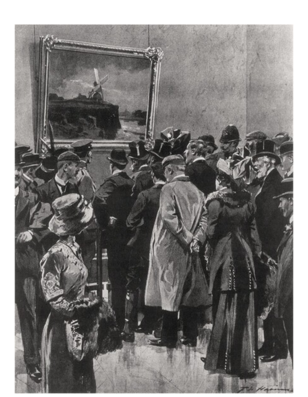
fig. 1 The Illustrated London News, vol. 274, March 25, 1911