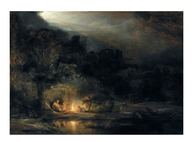
fig. 5 Rembrandt van Rijn, Rest on the Flight into Egypt , 1647, oil on panel, National Gallery of Ireland, Dublin.