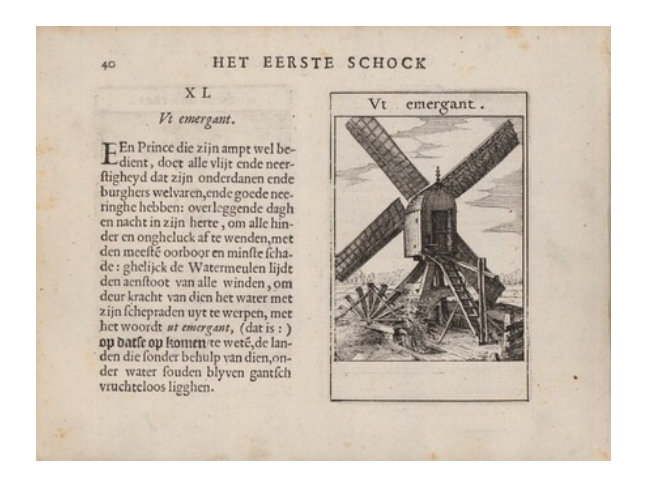
fig. 9 Roemer Visscher, "Ut emergant," emblem from Zinne-poppen , Amsterdam, 1614