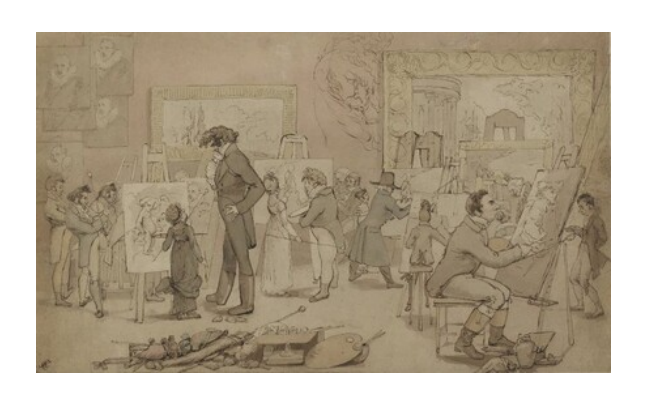
fig. 3 Alfred Edward Chalon, Study at the British Institution , 1806, pen and ink and wash, British Museum, London.