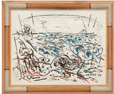
John Marin American, 1870 - 1953