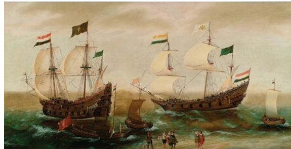
fig. 2 Cornelis Verbeeck, Ships off the Coast , c. 1620, oil on panel, Frans Hals Museum, Haarlem