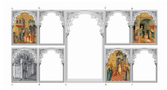
fig. 2 Reconstruction of a dispersed altarpiece by Andrea di Bartolo (color images are NGA objects): a. Joachim and Anna Giving Food to the Poor and Offerings to the Temple; b. Expulsion of Joachim (?), lost; c. Joachim Leaving Jerusalem (fig. 1); d. Annunciation of the Birth of Mary (?), lost; e. Lost; f. Meeting at Porta Aurea (?), lost; g. The Nativity of the Virgin; h. The Presentation of the Virgin in the Temple; i. Marriage of the Virgin (?), lost