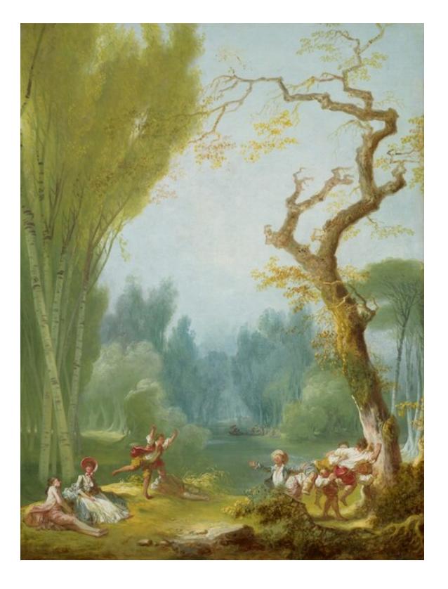
fig. 1 Jean Honoré Fragonard, A Game of Horse and Rider , c. 1775/1780, oil on canvas, National Gallery of Art, Washington, Samuel H. Kress Collection, 1946.7.5