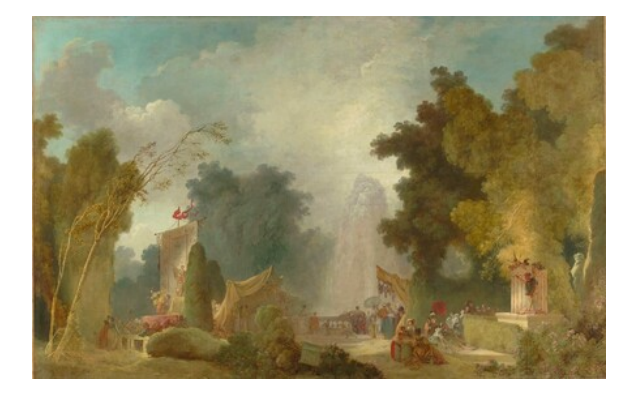
fig. 4 Jean-Honoré Fragonard, Fête at Saint-Cloud , c. 1775–1780, oil on canvas, Banque de France, Paris, France.

fig. 3 Jean Honoré Fragonard, The Swing , c. 1775/1780, oil on canvas, National Gallery of Art, Washington, Samuel H. Kress Collection, 1961.9.17