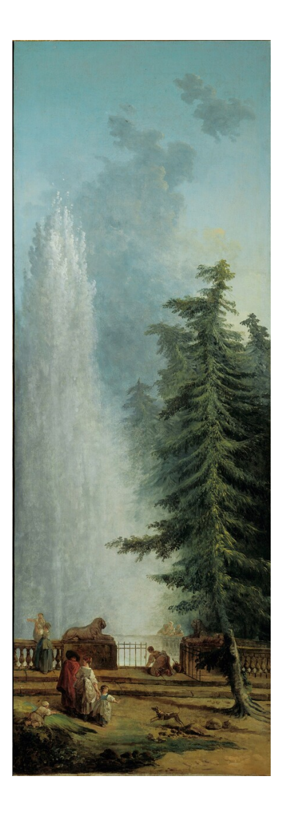
fig. 5 Hubert Robert, Jet d'eau, 1783, oil on canvas, Musée du Louvre, Paris, France.