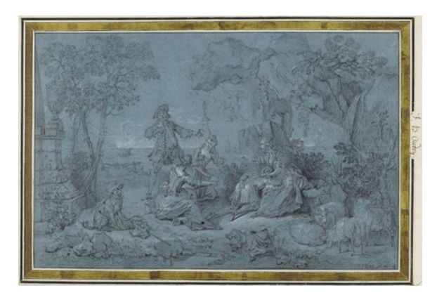
fig. 7 Jean Baptiste Oudry, Hot Cockles (La Main Chaud) , 1728, black and white chalk, Nationalmuseum, Stockholm.