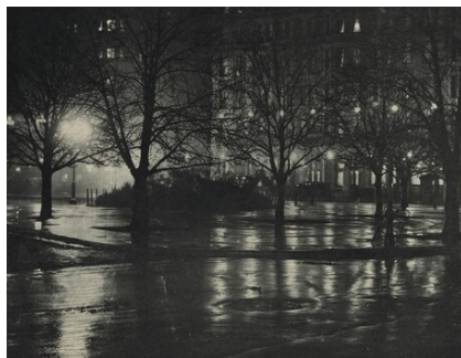
Alfred Stieglitz Reflections: Night—New York 1897 photogravure Key Set Number 252