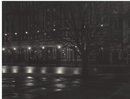
Alfred Stieglitz Night—The Savoy 1897, printed 1929/1932 gelatin silver print Key Set Number 255

A print from the same negative—perhaps a photograph from the Gallery's collection—appeared in the following exhibition(s) during Alfred Stieglitz's lifetime: