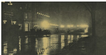
Alfred Stieglitz The Glow of Night—New York 1896, printed 1897 photogravure Key Set Number 251