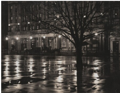
Alfred Stieglitz Night—New York 1897, printed 1929/1932 gelatin silver print Key Set Number 254