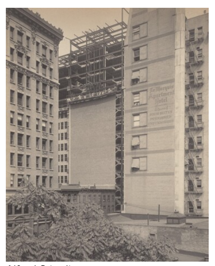
Alfred Stieglitz From the Back-Window—291—Wall Closing In 1916 platinum print Key Set Number 427