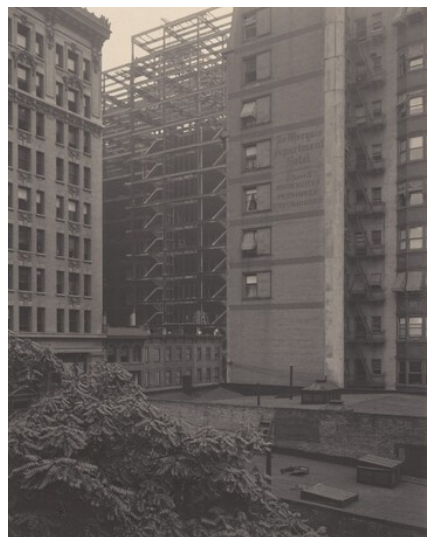
Alfred Stieglitz From the Back-Window—291—Building in Construction 1916 platinum print Key Set Number 426