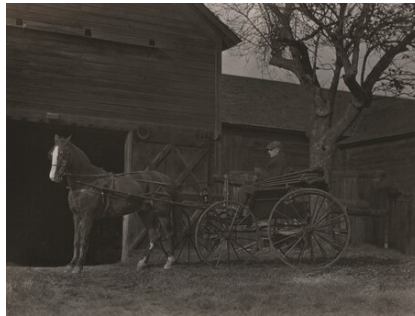
Alfred Stieglitz Horse and Carriage probably 1922 gelatin silver print Key Set Number 788