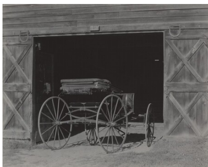
Alfred Stieglitz Barn and Carriage 1922 gelatin silver print Key Set Number 785