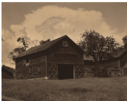
Alfred Stieglitz The Barn 1922 palladium print Key Set Number 780