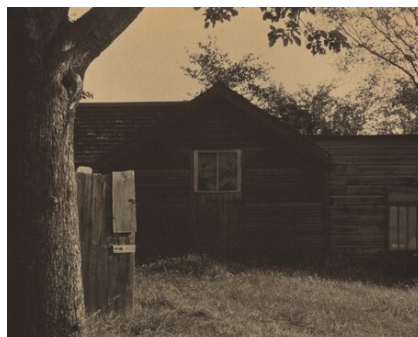
Alfred Stieglitz The Barn 1922 palladium print Key Set Number 783