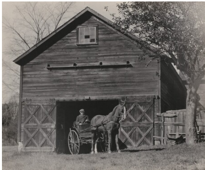
Alfred Stieglitz Horse and Carriage probably 1922 gelatin silver print Key Set Number 787