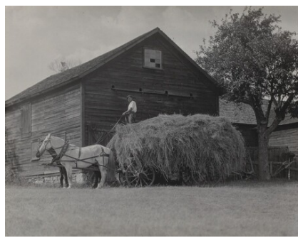
Alfred Stieglitz The Hay Wagon and Barn 1922 gelatin silver print Key Set Number 786