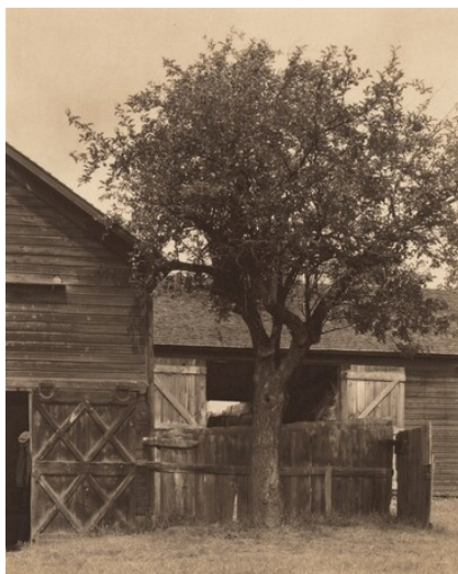
Alfred Stieglitz The Barn 1922 palladium print Key Set Number 781