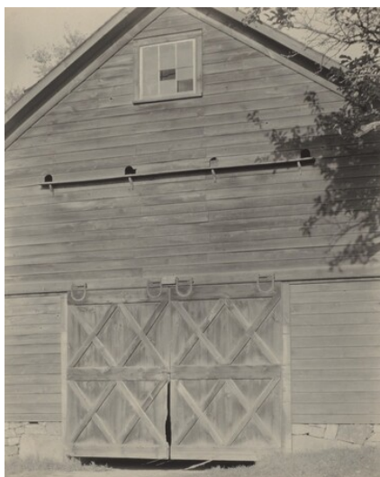
Alfred Stieglitz The Barn 1922 gelatin silver print Key Set Number 784