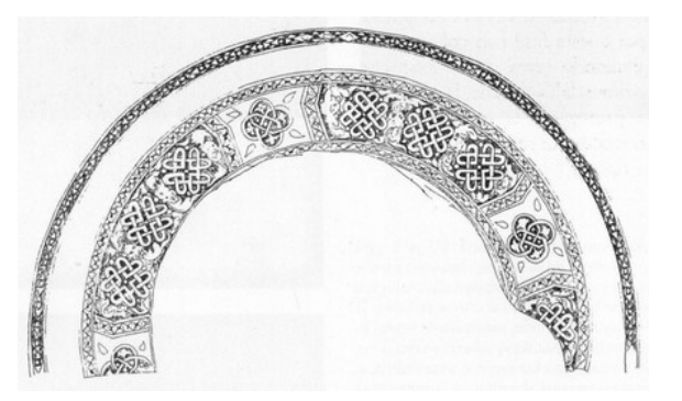
fig. 6 Graphic tracing of the decoration of the halo of Christ, Giotto, Painted Crucifix , San Felice in Piazza, Florence

fig. 5 Graphic tracing of the halos and pseudo-Kufic lettering, Giotto, Madonna and Child , c. 1310/1315, tempera on poplar, National Gallery of Art, Washington, Samuel H. Kress Collection.