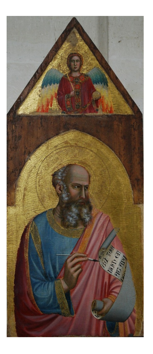
fig. 2 Giotto, Saint John the Evangelist , c. 1310/1315, tempera on panel, Musée Jacquemart-André, Abbaye royale de Chaalis-Institute de France, Fontaine-Chaalis