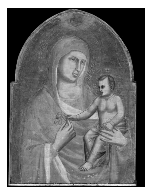
fig. 2 Infrared reflectogram, Giotto, Madonna and Child , c. 1310/1315, tempera on poplar, National Gallery of Art, Washington, Samuel H. Kress Collection