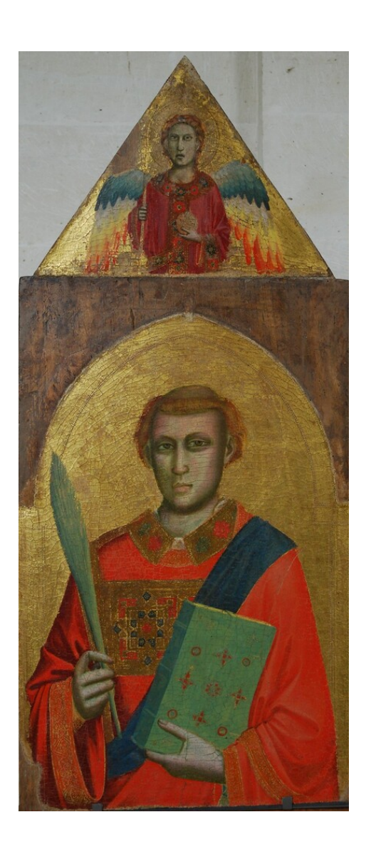
fig. 3 Giotto, Saint Lawrence , c. 1310/1315, tempera on panel, Musée Jacquemart-André, Abbaye royale de Chaalis-Institute de France, Fontaine-Chaalis