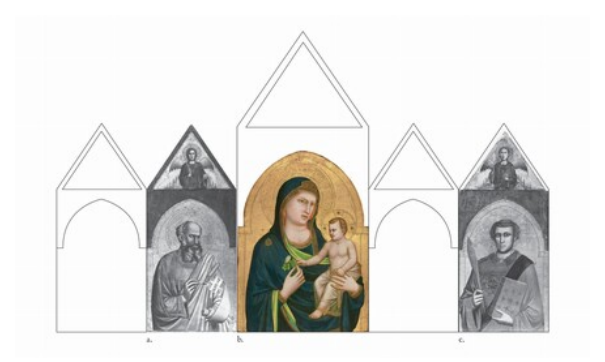
fig. 1 Reconstruction of a dispersed polyptych by Giotto: a. Saint John the Evangelist (fig. 2); b. Madonna and Child; c. Saint Lawrence (fig. 3)