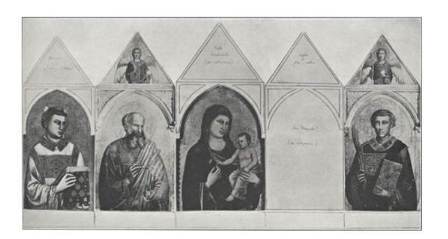
fig. 4 Reconstruction of the Badia polyptych by Giotto as proposed by Roberto Longhi, from left to right: Saint Stephen , Museo Horne, Florence; Saint John the Evangelist (fig. 2); Madonna and Child , NGA; Saint Lawrence (fig. 3)