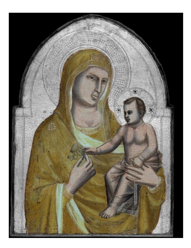
fig. 1 Artificial-colored hyperspectral infrared reflectogram, Giotto, Madonna and Child , c. 1310/1315, tempera on poplar, National Gallery of Art, Washington, Samuel H. Kress Collection. The green earth wash appears red in this image because it has decreased absorption at the wavelength chosen for the red display channel. The verdaccio and drawing appears black.