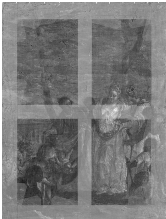
fig. 5 X-radiograph, Veronese, The Finding of Moses , c. 1581/1582, oil on canvas, National Gallery of Art, Washington, Andrew W. Mellon Collection