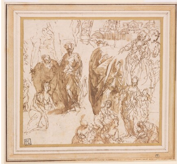
fig. 3 Veronese, Studies for the Finding of Moses , 1581, pen and brown ink, brown wash, on paper, The Morgan Library and Museum, IV, 81, Purchased by Pierpont Morgan (1837–1913) in 1909. The Pierpont Morgan Library, New York