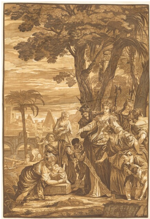
fig. 2 John Baptist Jackson, after Veronese, The Finding of Moses , 1741, chiaroscuro woodcut in buff, light brown, light violet gray, and dark gray, National Gallery of Art, Washington, Rosenwald Collection