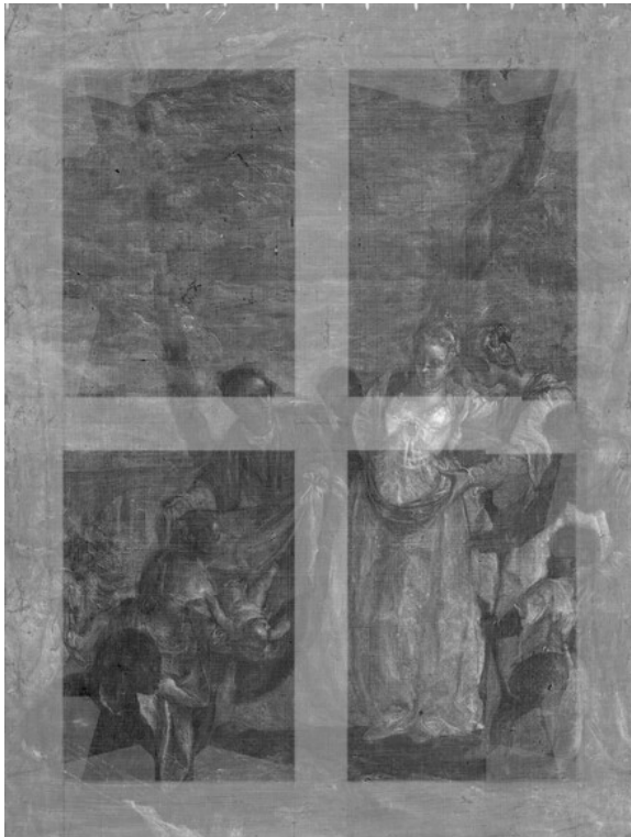
fig. 1 X-radiograph, Veronese, The Finding of Moses , c. 1581/1582, oil on canvas, National Gallery of Art, Washington, Andrew W. Mellon Collection