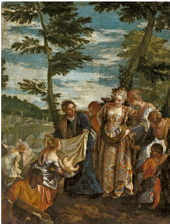
fig. 1 Veronese, The Finding of Moses , c. 1580, oil on canvas, Museo Nacional del Prado.