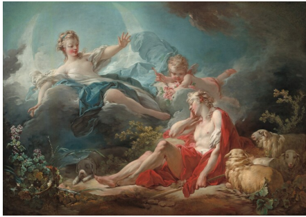
Jean Honoré Fragonard French, 1732 - 1806