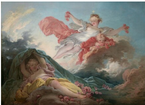
fig. 1 Jean-Honoré Fragonard, Aurora , c. 1755–1756, oil on canvas, Museum of Fine Arts, Boston. Museum purchase with funds by exchange by contribution, and by exchange from a Gift of Laurence K. and Lorna J. Marshall.