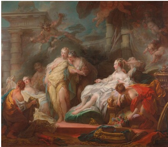
fig. 3 Jean-Honoré Fragonard, Psyche Showing Her Sisters the Gifts She Has Received from Cupid , 1753–1754, oil on canvas, Bought, 1978 (NG6445). National Gallery, London, Great Britain. www.nationalgallery.org.uk