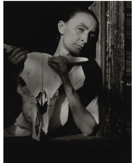
Alfred Stieglitz Georgia O'Keeffe 1931 gelatin silver print Key Set Number 1433