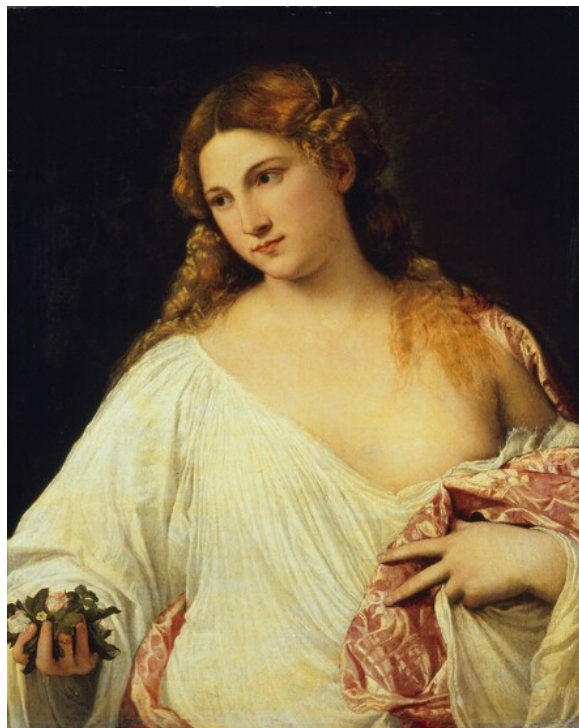
fig. 3 Titian, Portrait of a Woman, Called "Flora" , c. 1520–1522, oil on canvas, Galleria degli Uffizi, Florence.