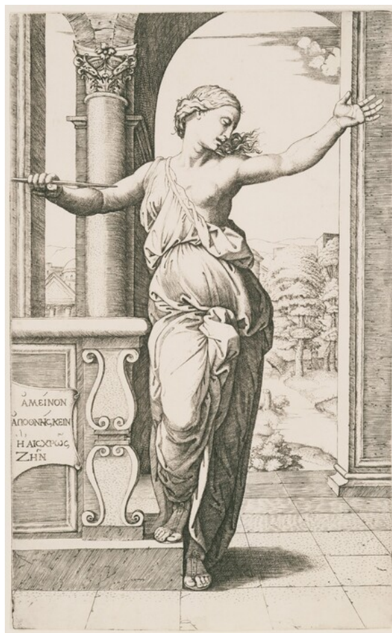
fig. 2 Marcantonio Raimondi after Raphael, Lucretia , c. 1511–1512, engraving, Harvey D. Parker Collection, Museum of Fine Arts, Boston.