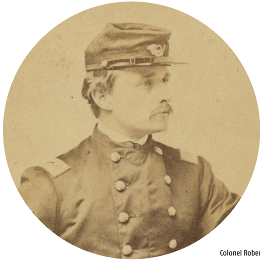
Colonel Robert G. Shaw/Whipple (detail), 96 Washington Street, Boston.