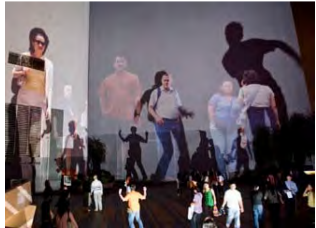
7 Body Movies shown in Hong Kong in 2006