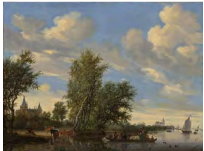
7 Salomon van Ruysdael, River Landscape with Ferry , 1649

Features: Rivers/canals/inland waterways, windmills, marshes, urbanization/development, seafaring/trade, spires