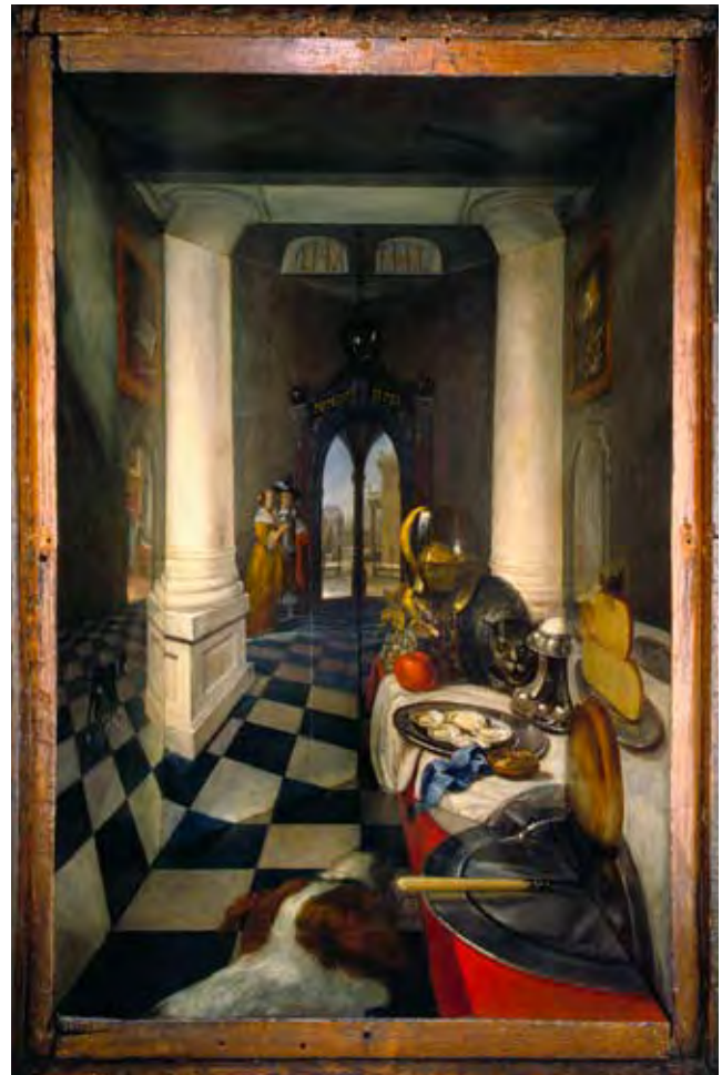
3 Samuel van Hoogstraten, Perspective Box of a Dutch Interior , 1663

This small painting, when hung on a matching colored wall, convincingly suggests that there is a real bird on its perch. The effect of “fooling the eye” is called trompe l’oeil .