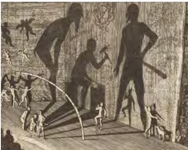
4 Samuel van Hoogstraten, Schaduwendans (Shadow Dance) from Inleyding tot de Hooge Schoole de Schilderkonst (Introduction to the Noble School of Painting) , published 1678

This panel of Hoogstraten’s perspective box — a painting created on separate panels assembled into a faceted boxlike form — shows how the artist distorted the image. When seen from a designated vantage point — in this case, a peephole drilled into a cover over the front of the box (here, the cover is removed), the picture resolves into the correct proportions.