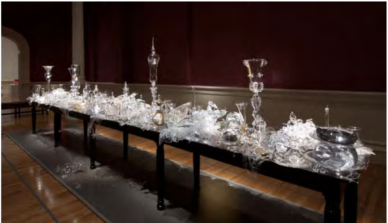
4 Beth Lipman, Bancketje (Banquet Piece) , 2003