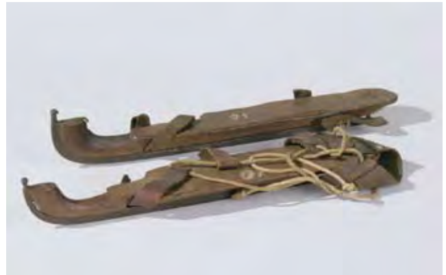
8 Ice skates, 1825 – 1875

The undersides of these skates are polished from use on ice. They were found in the Moorfields area, which today lies within the City of London.