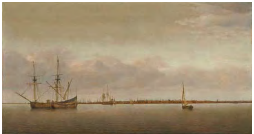
12 Abraham de Verwer, View of Hoorn , c. 1650