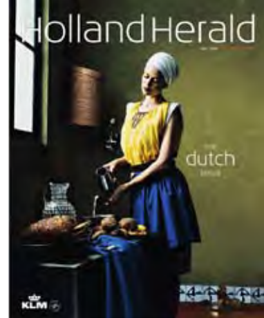
6 Cover of Holland Herald magazine, May 2009

This image from a KLM in-flight magazine celebrates Vermeer's Milkmaid .