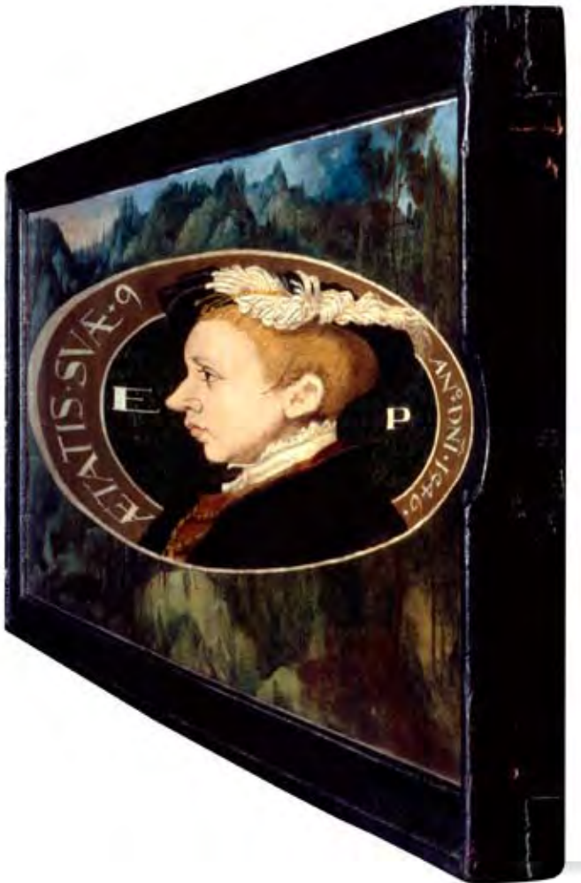
5 William Scrots, King Edward VI , 1546, viewed from right edge

This portrait is an example of anamorphosis, an image that looks distorted when viewed from any vantage point other than the one determined by the artist. When viewed from the front 6, the portrait is distorted; when viewed from the right edge 5, the image assumes correct proportions. (The landscape background is not distorted.) Scrots was a Dutch artist who worked at the court of Henry VIII. Such paintings, which amazed viewers and displayed the artist's skill, may have been created to amuse the young Edward. He succeeded his father, Henry VIII, in 1547 at the age of nine.