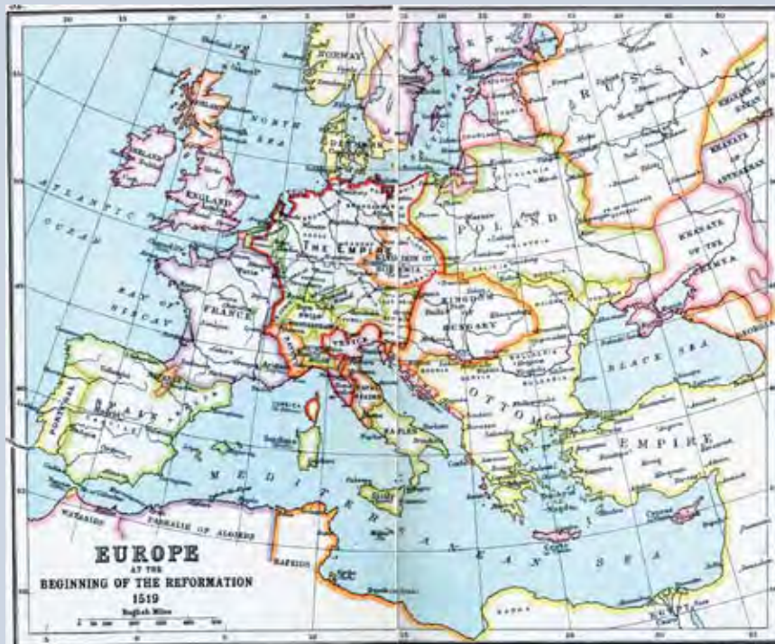
13 "Europe at the Beginning of the Reformation, 1519," from A Literary & Historical Atlas of Europe

father in the United States. In 1579, the Union of Utrecht created a military alliance among the seven northern provinces for defense against Spanish attack. By 1581, these seven provinces rejected Philip II's rule entirely. They declared independence and formed a confederation of states based upon a republican model of government. Called the United Provinces of the Netherlands , the fledgling nation became the first to secede from a major European power. The United Provinces of the Netherlands did not achieve peace with Spain until the signing of the Treaty of Münster in 1648, which marked the official end of the Eighty Years' War 15. And with that, the Dutch Republic — a diplomatically recognized, independent nation — was born (see p. 14, PDGA ).