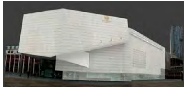
10 White light from the xenon projector over the portraits (washing them out)