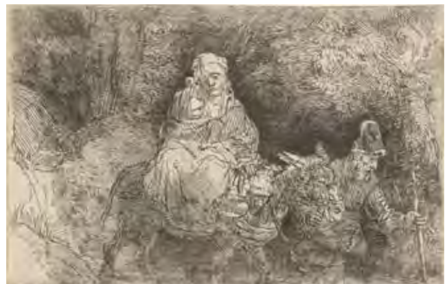
5 Rembrandt van Rijn, The Flight into Egypt: Crossing a Brook , 1654