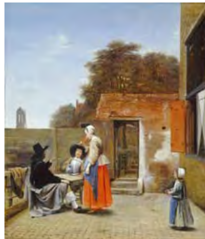
2 Pieter de Hooch, A Dutch Courtyard , 1658/1660