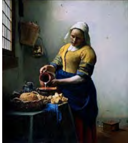
5 Johannes Vermeer, The Milkmaid , c. 1660

This painting by a contemporary artist mimics A Lady Writing 2, a Vermeer in the collection of the National Gallery of Art, Washington.