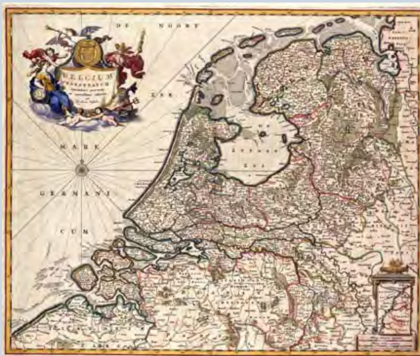
15 Nicolaes Visscher, Belgium Foederatum Emendata Auctum et Novissima Editum , before 1679, from Atlas Van der Hagen

The division between provinces in the Protestant north (light green) and the Catholic south (darker green) after 1568