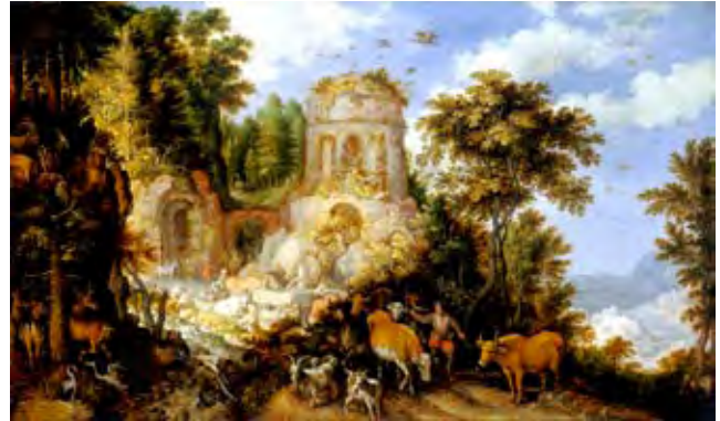
1 Roelandt Savery, Landscape with the Flight into Egypt , 1624