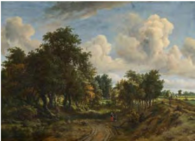
4 Meindert Hobbema, A Wooded Landscape , 1663

Features: Seafaring/trade, urbanization, harbor, transportation, church