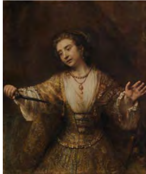
3 Rembrandt van Rijn, Lucretia , 1664

The story of this miraculous episode is from the Old Testament. Moses and his brother Aaron are leading the Israelites away from Egypt to the promised land. The journey is long and difficult, and the pilgrims find themselves without water in the arid wilderness. God instructs Moses to strike a rock, and it will yield water. He does as told, and water flows abundantly. The people and animals drink (Exod. 17: 1–7).