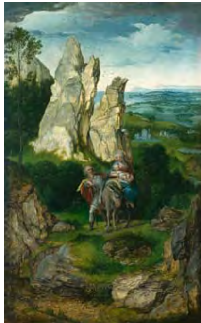
4 Follower of Joachim Patinir, The Flight into Egypt , c. 1550/1575