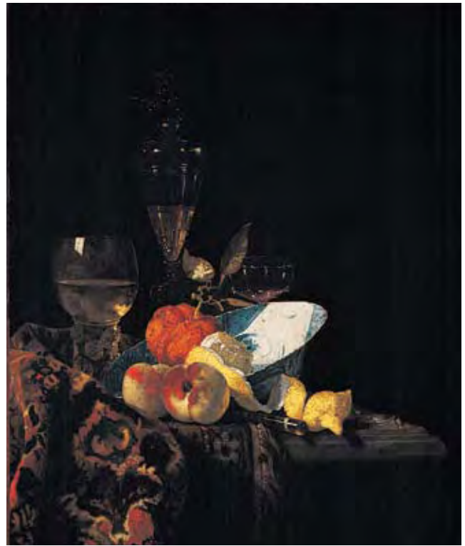
3 Willem Kalf, Still Life , c. 1660