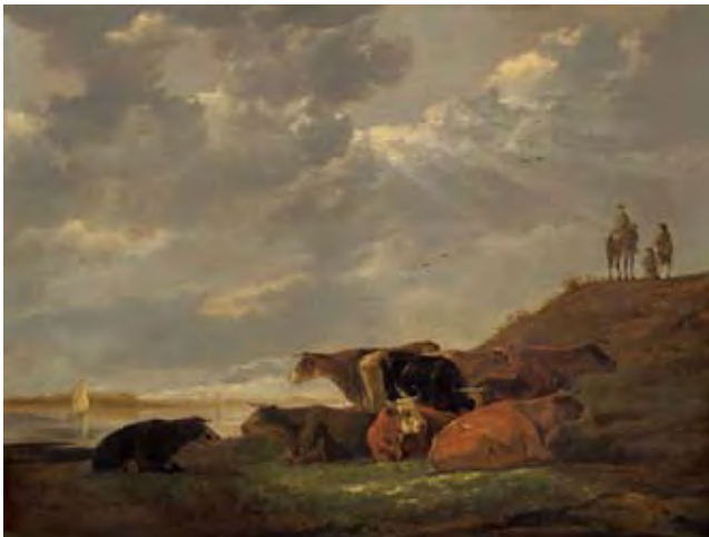
2 Aelbert Cuyp, River Landscape with Cows , 1645/1650

Features: Agriculture, rivers/inland waterways, seafaring/trade, transportation