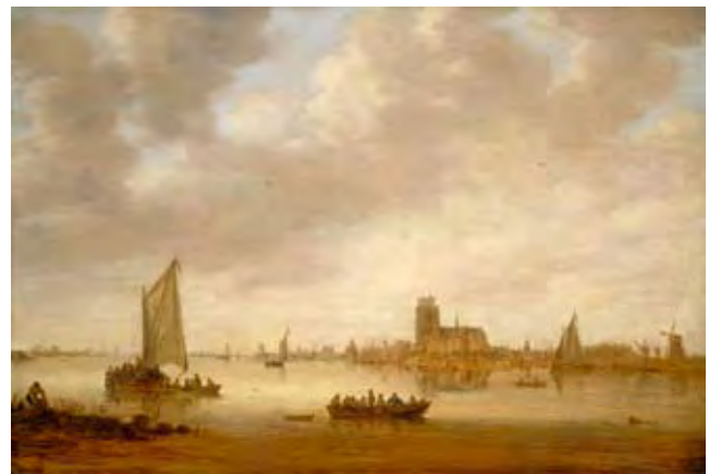
3 Jan van Goyen, View of Dordrecht from the Dordtse Kil , 1644

Features: Agriculture, rivers/inland waterways, seafaring/trade, transportation