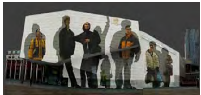
11 Portraits revealed again when passersby cast their own shadows upon the wall