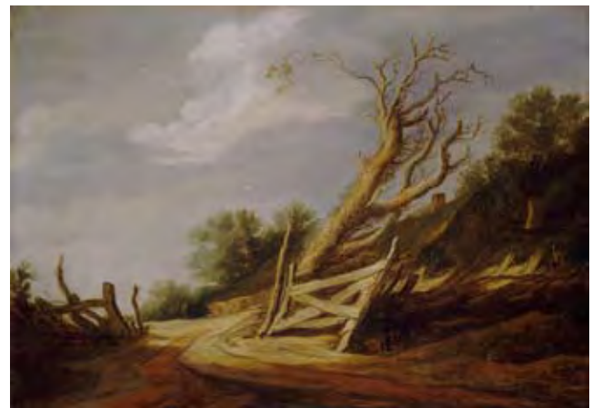
5 Pieter Molijn, Landscape with Open Gate , c. 1630

Features: Agriculture, rivers/canals/inland waterways, polder, roadway, village, deciduous trees