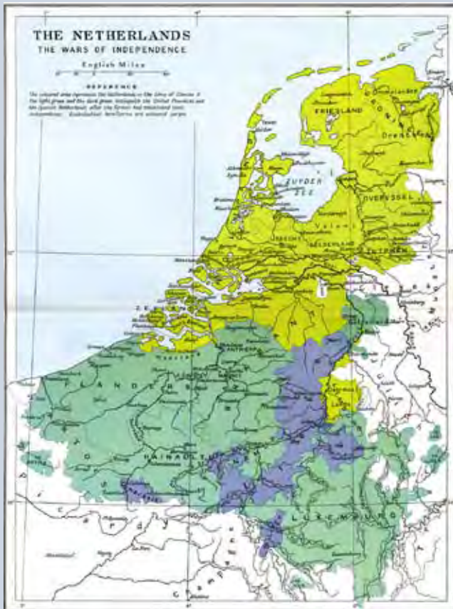
14 "The Netherlands: The Wars of Independence," from The Cambridge Modern History Atlas

The division between provinces in the Protestant north (light green) and the Catholic south (darker green) after 1568