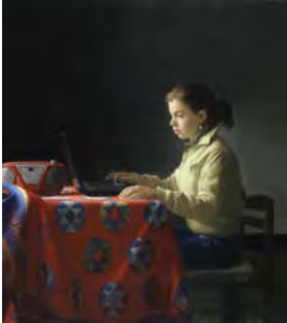
4 Jonathan Janson, Young Girl Writing an Email , 2007

This painting by a contemporary artist mimics A Lady Writing 2, a Vermeer in the collection of the National Gallery of Art, Washington.