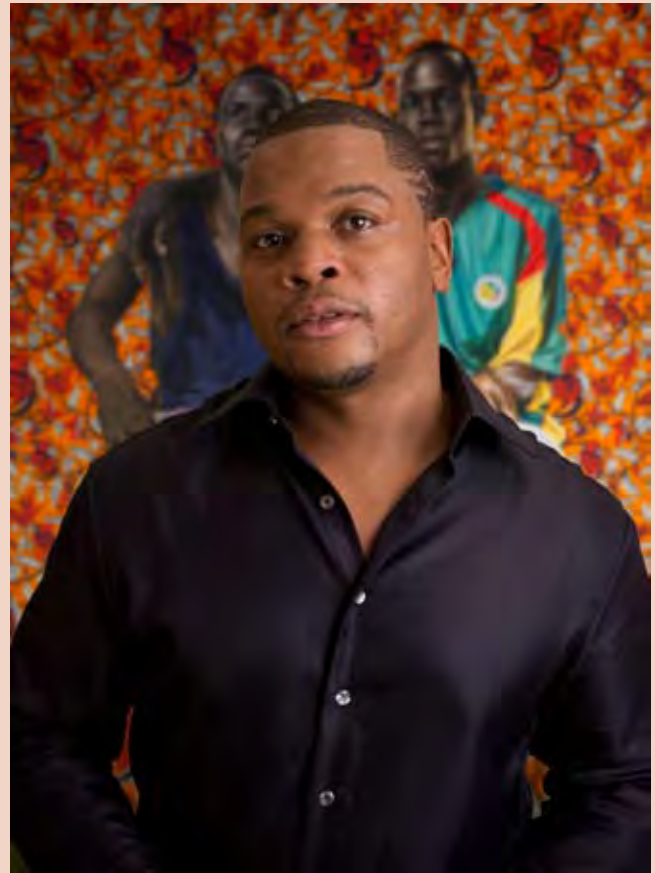
1 Contemporary artist Kehinde Wiley

During the seventeenth century, full-length portraits connoted a person’s authority and power. Before that time, full-length portraits were primarily reserved for royalty, the aristocracy, and other heads of state or church. As a wealthy merchant class grew in Europe, however, so too did the demand for portraits.