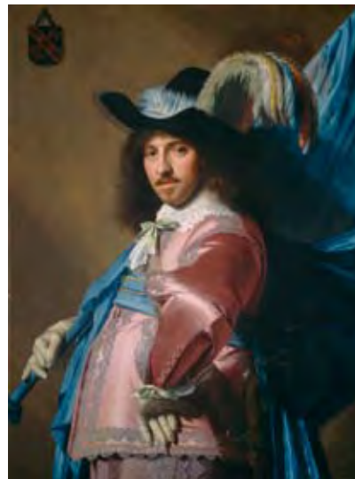
3 Johannes Verspronck, Andries Stilte as a Standard Bearer , 1640