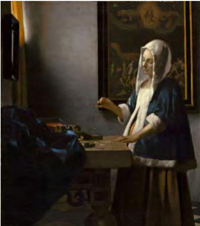
3 Johannes Vermeer, Woman Holding a Balance , c. 1664