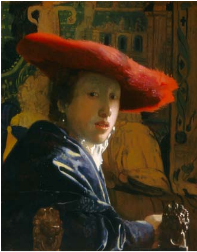
1 Johannes Vermeer, Girl with the Red Hat , c. 1665/1666