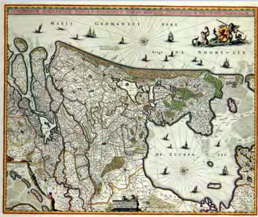
1 Nicolaes Visscher, Comitatus Hollandiae Tabula Pluribus Locus Recens Emendata , before 1682, from Atlas Van der Hagen

innovative civil engineers who invented ways to drain inland seas for farming and raising livestock (such emptied tracts, called polders , were particularly fertile) using power generated by windmills and protection offered by artificial landforms called dikes . (The saying “putting a finger in the dike” refers to the legend of a little Dutch boy who saved his community from flooding and prevented an onslaught of dire events.) Reclamation projects in the Netherlands began as early as the twelfth century, and during the period from 1590 to 1640 more than 200,000 acres of land were drained. Directed and controlled by dikes, canals, and channels, water provided inland transportation and irrigation systems.