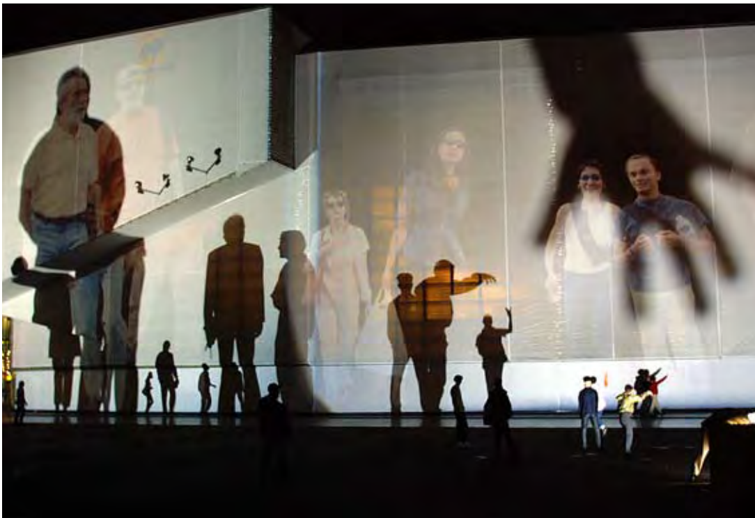
13 Body Movies shown in Rotterdam in 2001