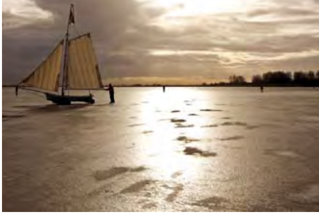
5 Ice-sailing.

The Dutch continue to enjoy a variety of winter sports.