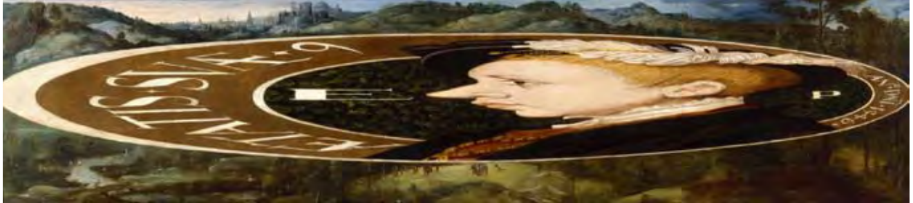
6 William Scrots, King Edward VI , 1546, viewed from front edge

This portrait is an example of anamorphosis, an image that looks distorted when viewed from any vantage point other than the one determined by the artist. When viewed from the front 6, the portrait is distorted; when viewed from the right edge 5, the image assumes correct proportions. (The landscape background is not distorted.) Scrots was a Dutch artist who worked at the court of Henry VIII. Such paintings, which amazed viewers and displayed the artist's skill, may have been created to amuse the young Edward. He succeeded his father, Henry VIII, in 1547 at the age of nine.