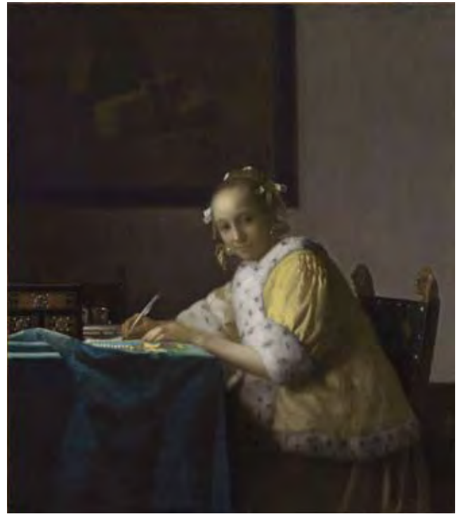
2 Johannes Vermeer, A Lady Writing , c. 1665