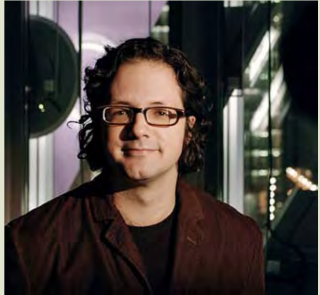
1 Contemporary artist Rafael Lozano-Hemmer

As people played in front of the light, another aspect of the project was revealed: still photographic portraits of people appeared within the area created by their shadows. These were digital photographic portraits the artist had taken of a thousand people in three cities—Montreal, Mexico City, and Rotterdam. A second projector (positioned above the searchlight and above people's heads) cast these portrait images in a row onto