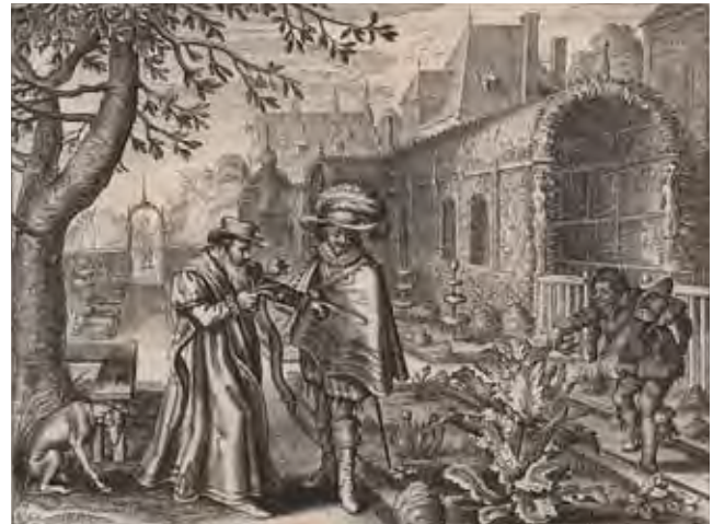
10 Adriaen van de Venne, Ex Minimis Patet Ipse Deus (God Is Revealed in the Smallest Work of His Creation) , illustration from Zeevsche Nachtegael (Middelburg, 1623)