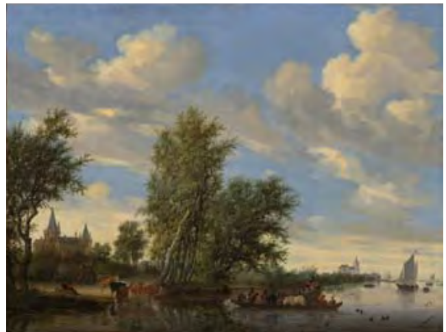
2 Salomon van Ruysdael, River Landscape with Ferry , 1649