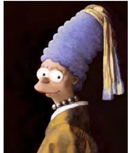
9 Marge Simpson as Vermeer's Girl with a Pearl Earring

Actress Scarlett Johansson played a fictional character named Griet, Vermeer's muse. The film is based on a novel of the same name by Tracy Chevalier.