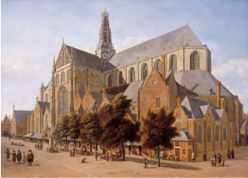
8 Gerrit Berckheyde, The Grote or Saint Bavokerk in Haarlem , 1666