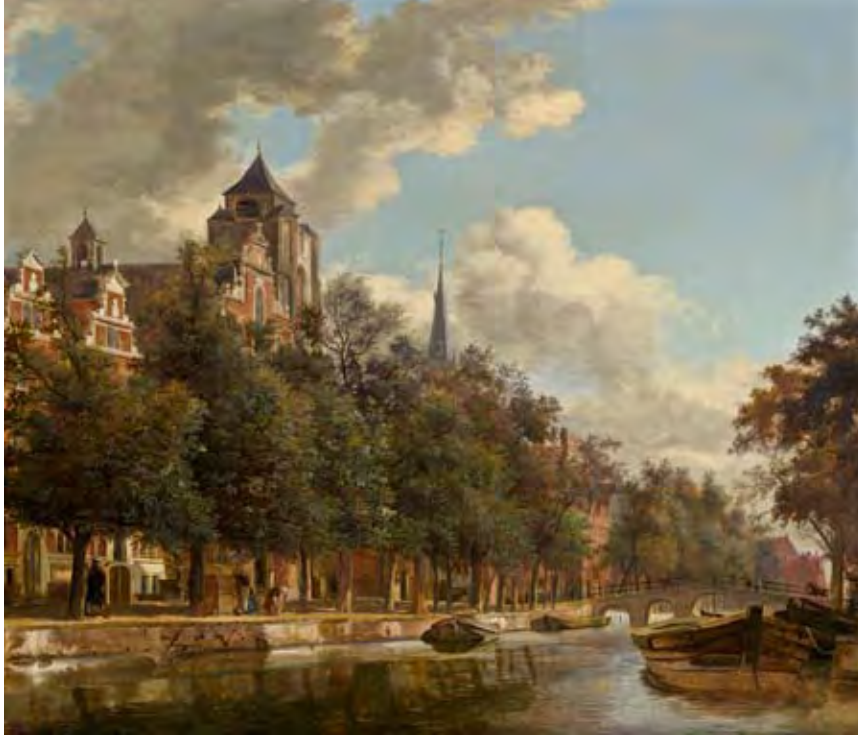
11 Jan van der Heyden, An Amsterdam Canal View with the Church of Veere , c. 1670