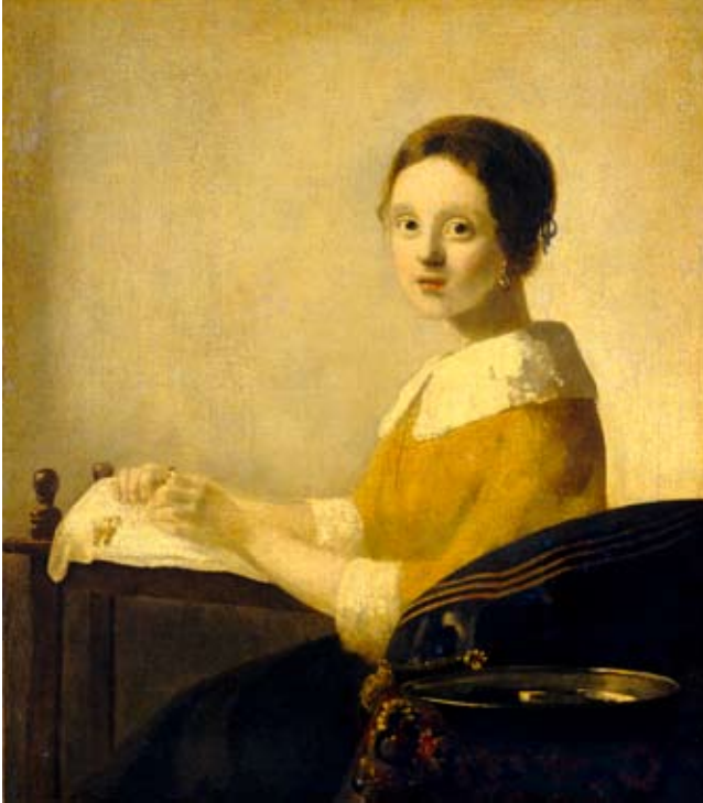
10 Imitator of Johannes Vermeer, The Lacemaker , c. 1925