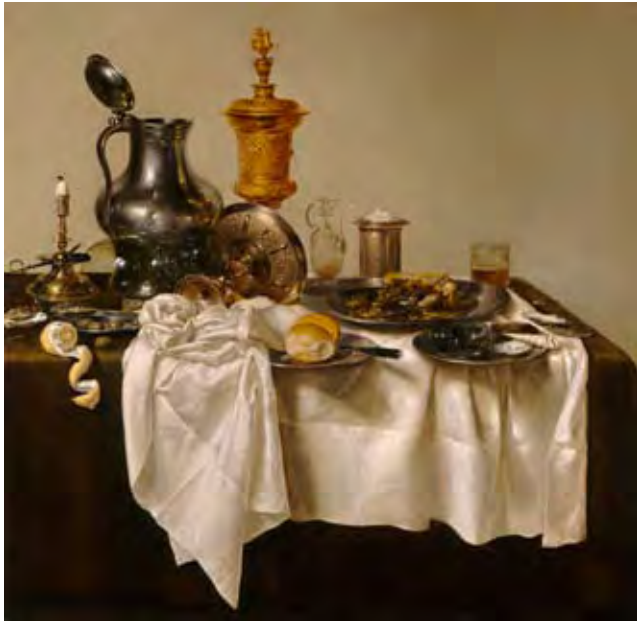
2 Willem Claesz Heda, Banquet Piece with Mince Pie , 1635