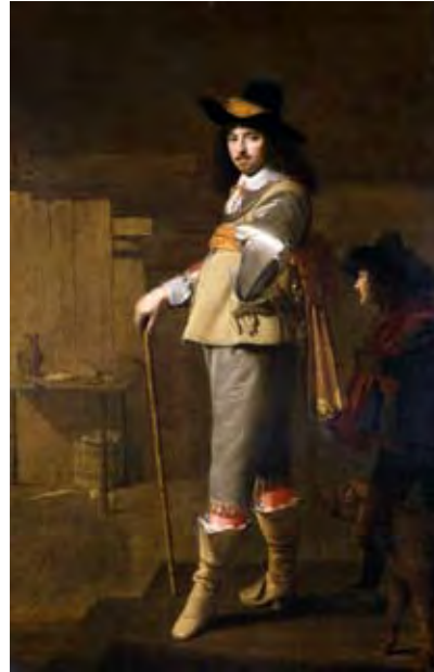
2 Johannes Verspronck, Portrait of Andries Stilte , 1639–1640

Describe the setting/environment in which each man is placed. Be specific about colors, figures, and the space each man occupies. How does the setting contribute to the painting's overall effect?