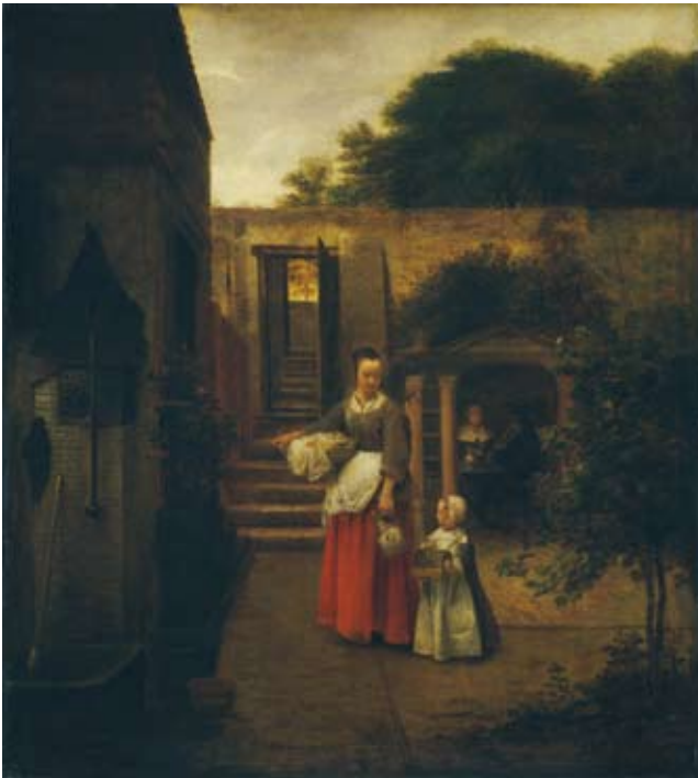
9 Pieter de Hooch, Woman and Child in a Courtyard , 1658/1660