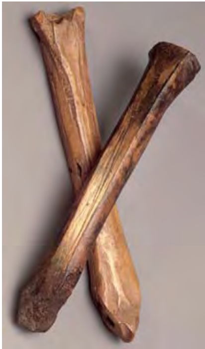
7 Bone skates, 12th century

This contemporary view looks like a re-creation of one of Hendrick Avercamp's winter skating scenes from the seventeenth century.