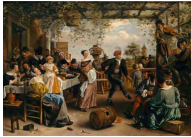
1 Jan Steen, The Dancing Couple , 1663