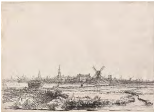
6 Rembrandt van Rijn, View of Amsterdam from the Northwest , c. 1640

Features: Dunes/sand, wind, roadway, fence, agriculture (note small figure of man with sheep)