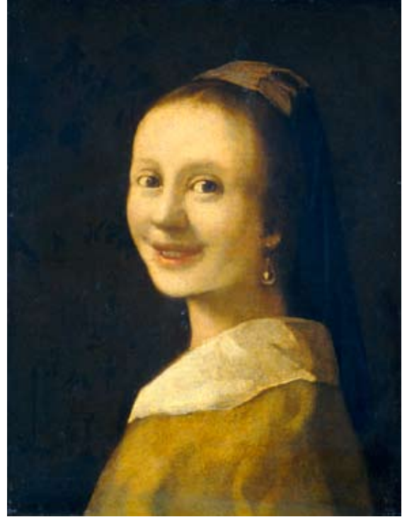
11 Imitator of Johannes Vermeer, The Smiling Girl , c. 1925