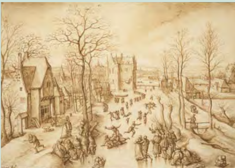
1 Hans Bol, Winter Landscape with Skaters , c. 1584/1586

Icy canals and inland lakes also offered entertainment to people of all ages and social stations. Play and recreation became a counterpoint to the focus on work and sober behavior. Skaters were joined by people in a variety of sleds and sleighs— prikslee , a single-person sled self-propelled with poles; bakslee , a simple sled that could hold more people and was either drawn by a horse or pushed; and arreslee , a decorated horse-drawn sleigh. Others played kolf , a sport that resembles a blend of ice hockey and golf (which developed in Scotland later). People sailed across the ice in wind-powered “ice yachts” at impressively fast speeds. Ice fishing was also a common pastime and important source of food over the course of the winter.