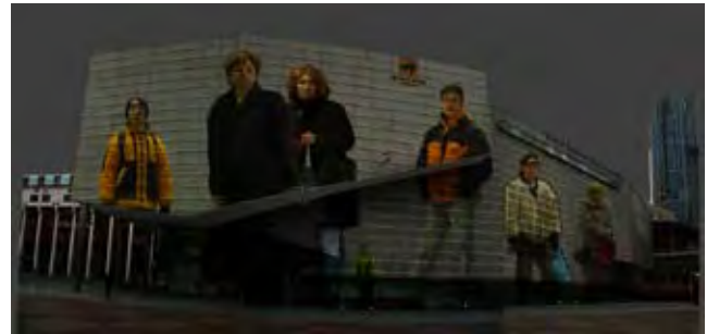
9 Still photographic portraits projected onto the building