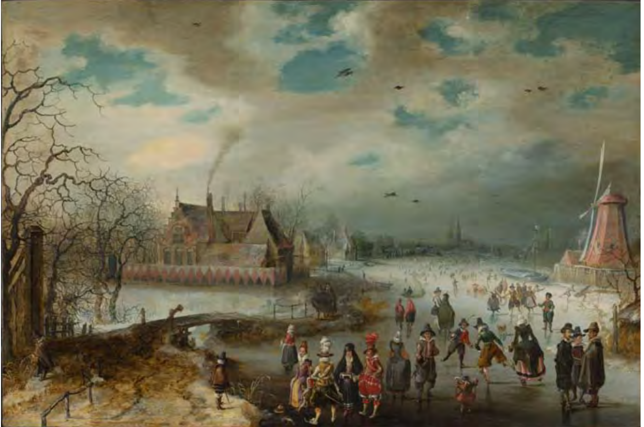
4 Adam van Breen, Winter Landscape with Skaters , c. 1611

One boat is frozen in the ice, while an iceboat sets off from the opposite bank.