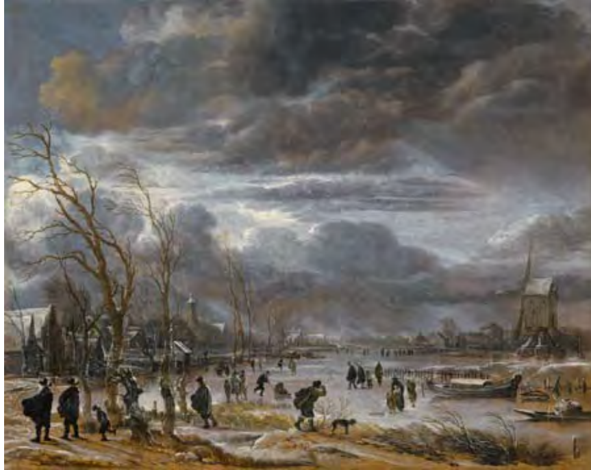
2 Aert van der Neer, A Snowy Winter Landscape , c. 1655–1660

In this painting, people are not lingering to gather or play but appear to be in transit from one place to another.