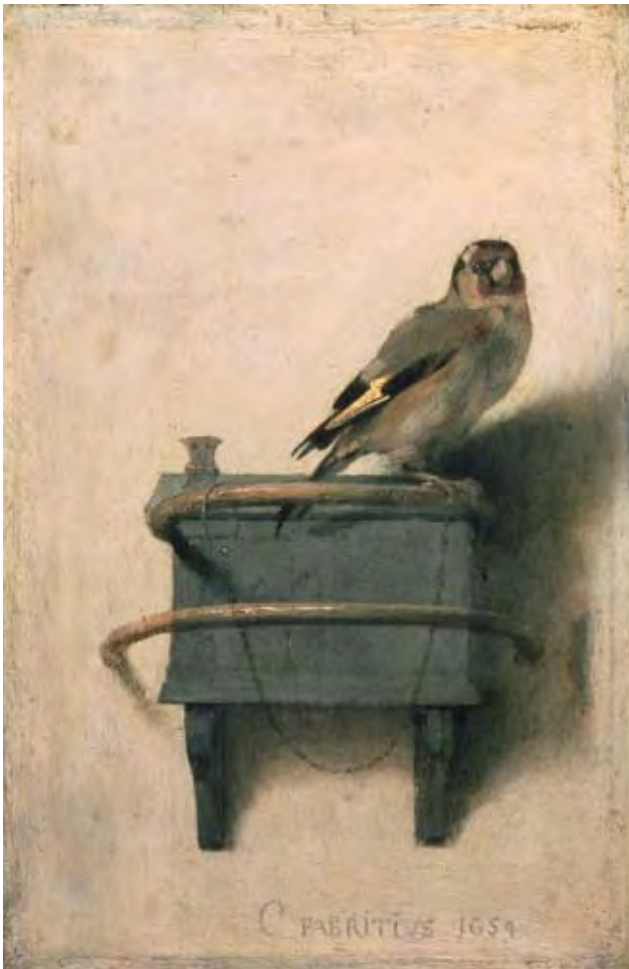
2 Carel Fabritius, The Goldfinch , 1654

This small painting, when hung on a matching colored wall, convincingly suggests that there is a real bird on its perch. The effect of “fooling the eye” is called trompe l’oeil .