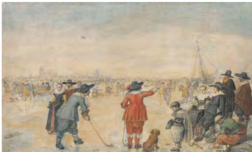
3 Hendrick Avercamp, Winter Games on the Frozen River IJssel , c. 1626

In this painting, people are not lingering to gather or play but appear to be in transit from one place to another.