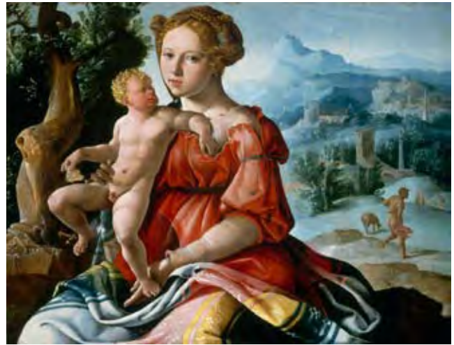
3 Maerten van Heemskerck, The Rest on the Flight into Egypt , c. 1530