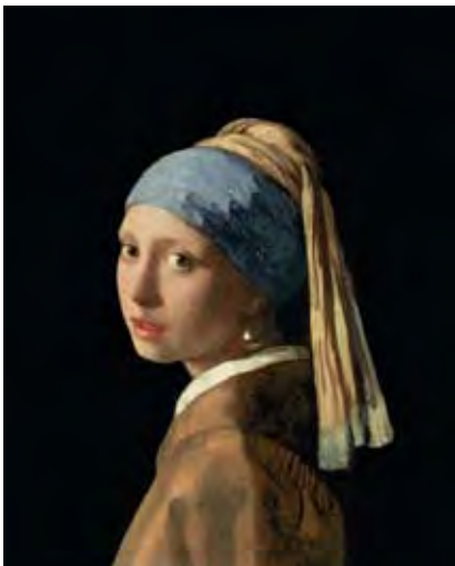
7 Johannes Vermeer, Girl with a Pearl Earring , c. 1665 – 1666

This image from a KLM in-flight magazine celebrates Vermeer's Milkmaid .