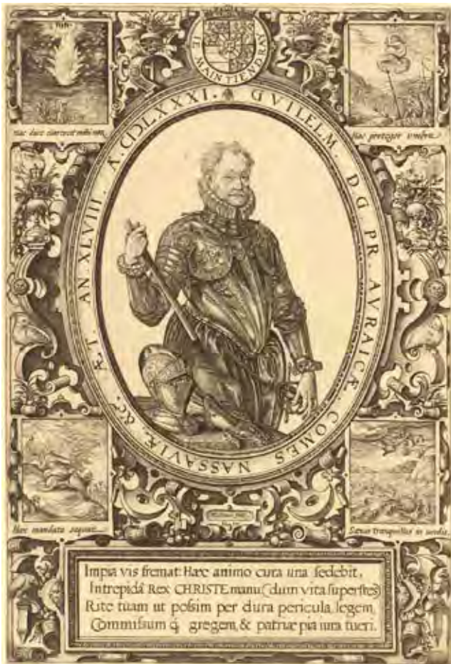
4 Hendrik Goltzius, William, Prince of Nassau-Orange , 1581