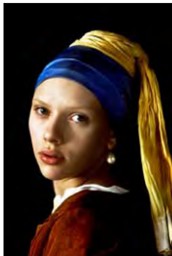
8 Still from motion picture Girl with the Pearl Earring , 2004

Actress Scarlett Johansson played a fictional character named Griet, Vermeer's muse. The film is based on a novel of the same name by Tracy Chevalier.