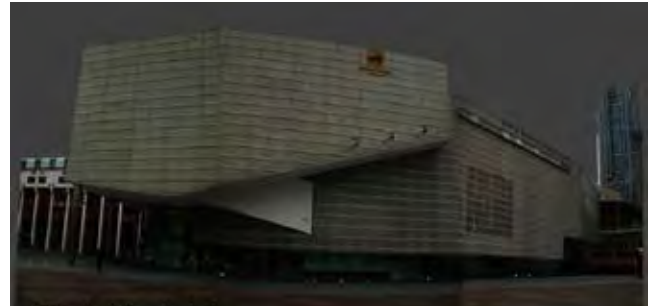
8 The façade of the building used in the project in darkness

When proposing the project to city officials in Rotterdam, the artist used these images to illustrate the different layers.