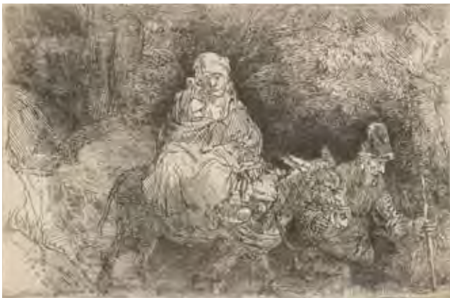
1 Rembrandt van Rijn, The Flight into Egypt: Crossing a Brook , 1654

In this story (Matt. 2:1–15) Joseph dreamed of an angel who warned him to take Mary and the infant Jesus from Bethlehem and flee into Egypt for their safety. The angel told him that King Herod — who had heard of the birth of a prophet (and threat to his authority) — intended to seek out and destroy him. The Holy Family set off for Egypt by night.