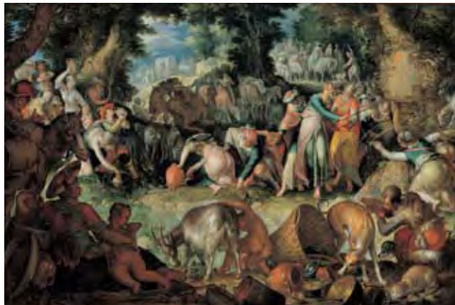
2 Joachim Anthonisz Wtewael, Moses Striking the Rock , 1624

The story of this miraculous episode is from the Old Testament. Moses and his brother Aaron are leading the Israelites away from Egypt to the promised land. The journey is long and difficult, and the pilgrims find themselves without water in the arid wilderness. God instructs Moses to strike a rock, and it will yield water. He does as told, and water flows abundantly. The people and animals drink (Exod. 17: 1–7).