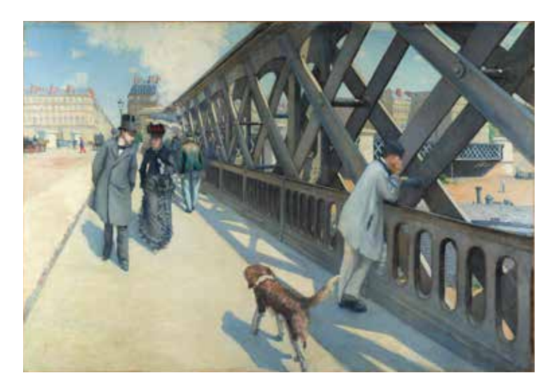
FIG. 4 The Pont de l'Europe, 1876, oil on canvas, Association des Amis du Petit Palais, Geneva.

contained within clearly demarcated borders. Only in the plumes of steam and clouds and the dog's fur (and quite subtly in the modeling of the street and sidewalk) did Caillebotte permit himself looser brushwork. Paris Street, Rainy Day (COVER) reflects a similar rigor in the handling of the brush. In both paintings, the artist explored the new spaces of a city profoundly transformed by the urban renovations guided by Baron Haussmann beginning in the 1850s. These improvements addressed a host of ills, including poor sanitation, traffic congestion, crowded streets, nighttime perils, and political unrest, by comprehensively modernizing central Paris. The two paintings profile the capital's new look, with its now iconic wide boulevards, ample sidewalks, and uniform buildings.