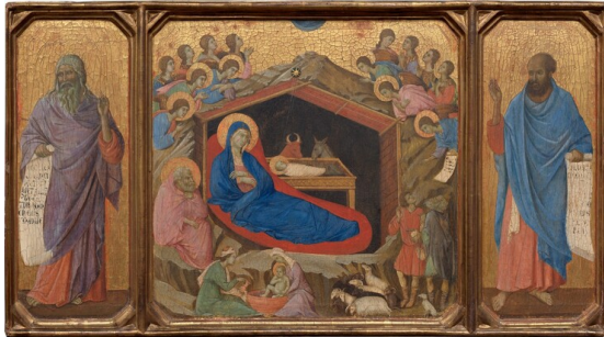
Duccio di Buoninsegna Sienese, c. 1250/1255 - 1318/1319