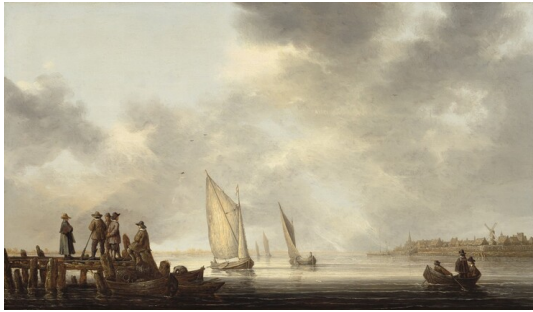
Aelbert Cuyp Dutch, 1620 - 1691