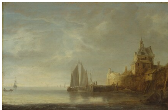
fig. 2 Simon de Vlieger, View of the Oostpoort , c. 1640, Hamburg Kunsthalle