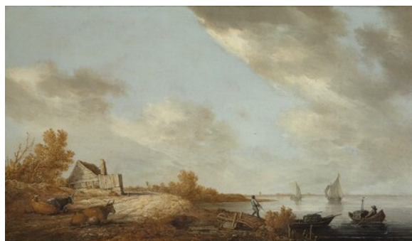
fig. 3 Aelbert Cuyp, Cattle and Cottage Near a River , early 1640s, Museum Boijmans Van Beuningen, Rotterdam.