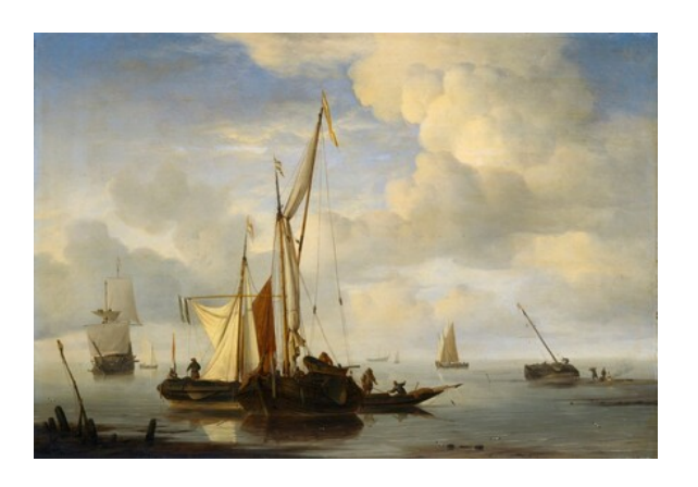
fig. 2 Willem van de Velde the Younger, Ships on a Calm Sea , early 1660s, oil on panel, private collection