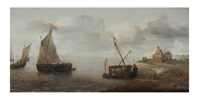
fig. 1 Jan Porcellis, Fishers on the Shore , c. 1622–1625, oil on panel, Hessisches Landsmuseum, Darmstadt.