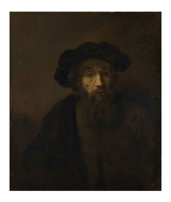
fig. 3 Rembrandt van Rijn, A Bearded Man in a Cap , 165(7), oil on canvas, National Gallery, London.