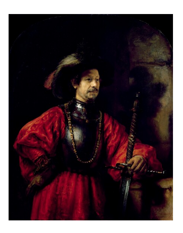
fig. 6 Unknown follower of Rembrandt, Man in a Military Costume , 1650, oil on panel, Fitzwilliam Museum, Cambridge.