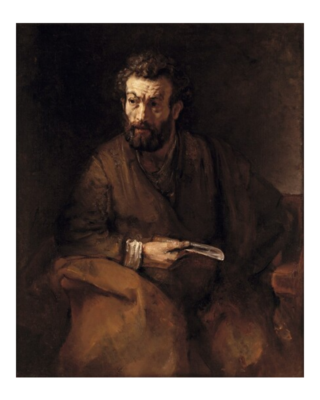
fig. 7 Rembrandt van Rijn, Saint Bartholomew , 1657, oil on canvas, Timken Museum of Art, Putnam Foundation, San Diego

Dutch\ Paintings\ of\ the\ Seventeenth\ Century