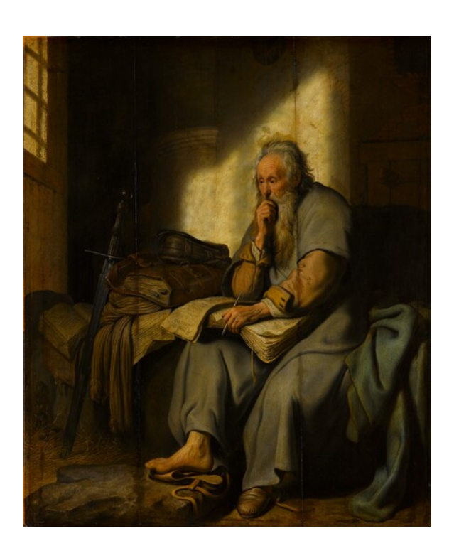
fig. 1 Rembrandt van Rijn, Saint Paul in Prison , 1627, oil on panel, Staatsgalerie, Stuttgart