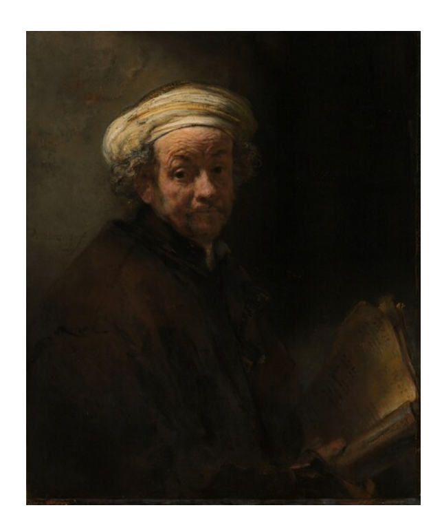
fig. 2 Rembrandt van Rijn, Self-Portrait as the Apostle Paul , 1661, oil on canvas, Rijksmuseum, Amsterdam.