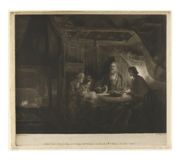
fig. 4 Thomas Watson, mezzotint after Philemon and Baucis , 1772, Rijksprentenkabinet, Amsterdam.