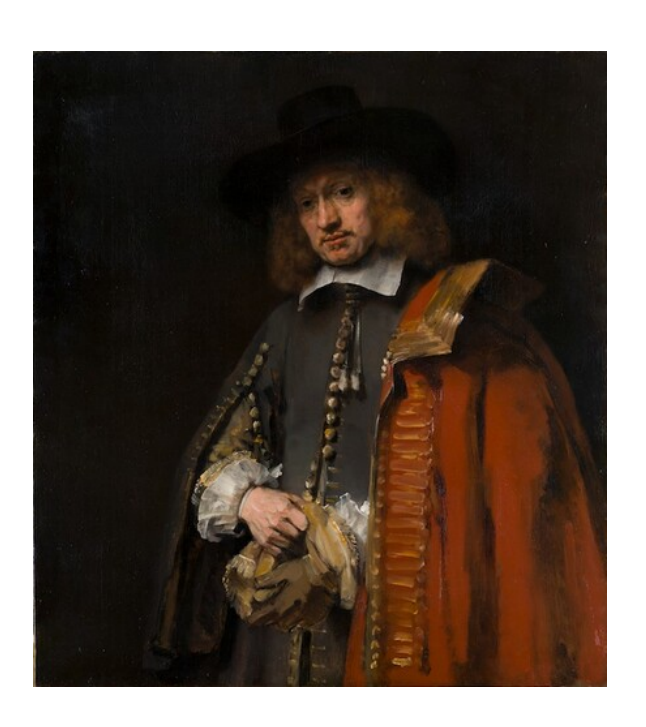
fig. 4 Rembrandt van Rijn, Jan Six , 1654, oil on canvas, Six Collection, Amsterdam