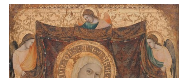
fig. 8 Detail of upper section, Giovanni Baronzio, Madonna and Child with Five Angels, c. 1335, tempera on panel, National Gallery of Art, Washington, Samuel H. Kress Collection