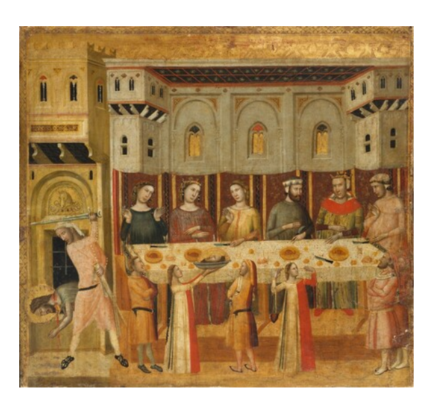
fig. 6 Giovanni Baronzio, Feast of Herod, c. 1335, tempera on panel, The Metropolitan Museum of Art, New York, Robert Lehman Collection