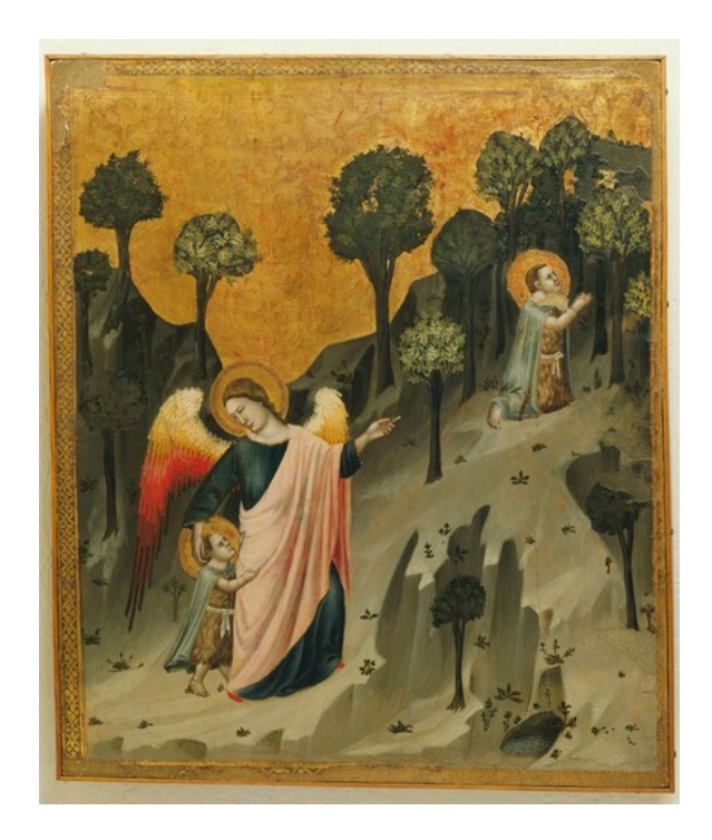
fig. 3 Giovanni Baronzio, Young Baptist Led by an Angel into the Wilderness, c. 1335, tempera on panel, Pinacoteca Vaticana.