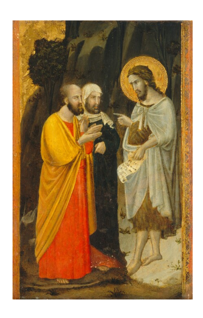
fig. 4 Giovanni Baronzio, The Baptist Interrogated by the Pharisees, c. 1335, wood transferred to Masonite, Seattle Art Museum, Samuel H. Kress Collection. Image: Eduardo Calderon