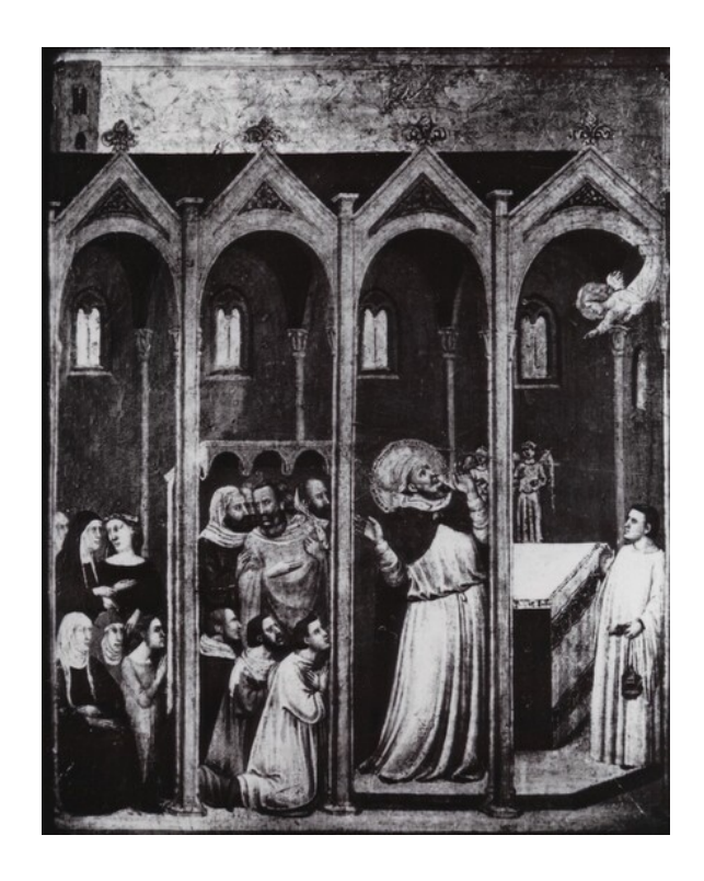
fig. 2 Giovanni Baronzio, Annunciation of the Birth of the Baptist, c. 1335, tempera on panel, now lost, formerly in the Street collection, Bath