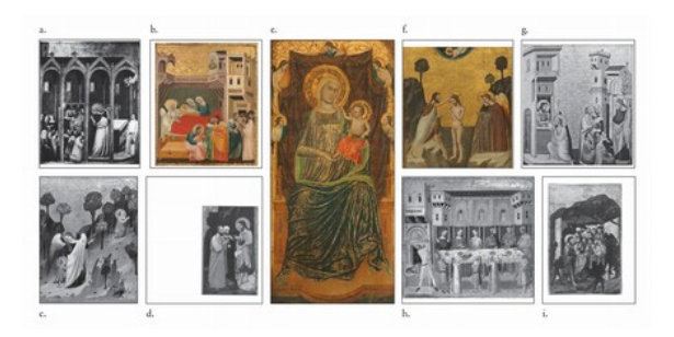
fig. 1 Reconstruction of a dispersed altarpiece by Giovanni Baronzio as proposed by Keith Christiansen (color images are NGA objects): a. Annunciation of the Birth of the Baptist (fig. 2); b. The Birth, Naming, and Circumcision of Saint John the Baptist; c. Young Baptist Led by an Angel into the Wilderness (fig. 3); d. The Baptist Interrogated by the Pharisees (fig. 4); e. Madonna and Child with Five Angels; f. The Baptism of Christ; g. The Baptist Sends His Disciples to Christ (fig. 5); h. Feast of Herod (fig. 6); i. The Baptist's Descent into Limbo (fig. 7)