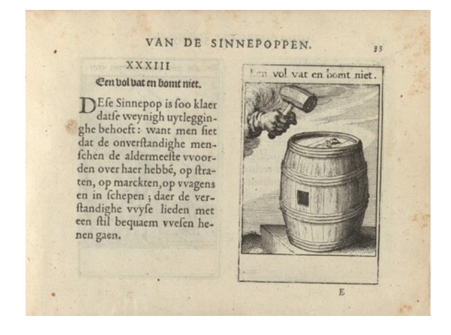
fig. 4 Roemer Visscher, "Een vol vat en bomt niet," emblem from Zinne-poppen , Amsterdam, 1614