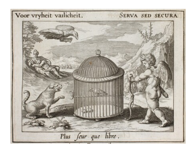
fig. 5 P. C. Hooft, "Voor vryheyt vaylicheyt," emblem from Emblemata Amatoria, Amsterdam, 1611

Dutch Paintings of the Seventeenth Century