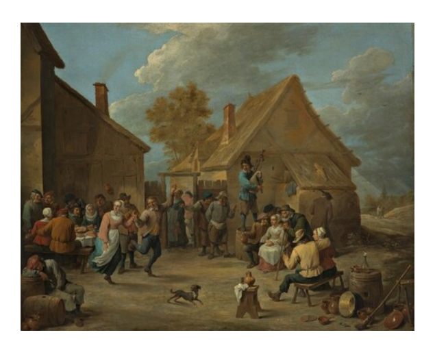
fig. 7 David Teniers the Younger, The Village Feast, 1651, oil on copper, Museum Boijmans Van Beuningen, Rotterdam.