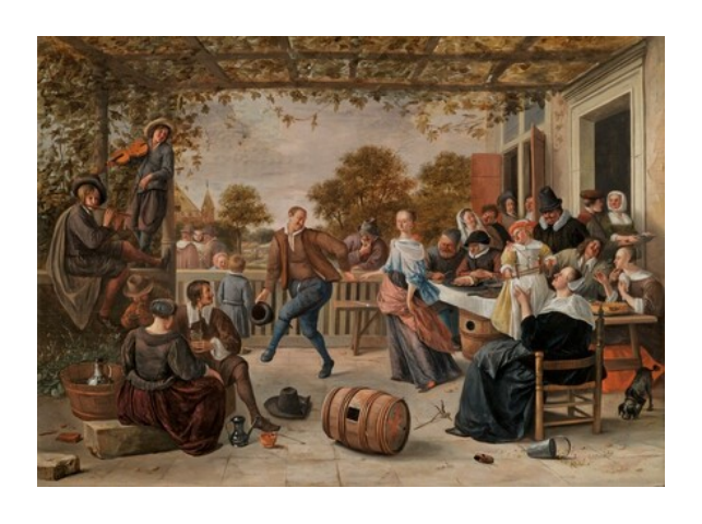
fig. 3 Jan Steen, A Terrace with a Couple Dancing to a Pipe and Fiddle, Peasants Eating and Merrymaking Behind, c. 1663, private collection (Sotheby's, London, 4 July 2007, lot 36).